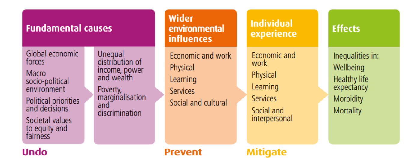
Figure 1: Public Health Scotland Framework depicting the Fundamental Causes theory

Public Health England developed a pathway that covers the similar influences but depicted in a slightly different way and with some additional details (57). This is shown in Figure 2: