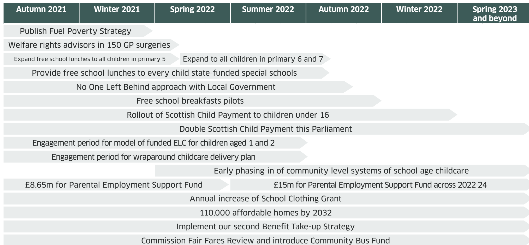
Figure 7: Strategy Delivery Plan for Financial security for low income households actions