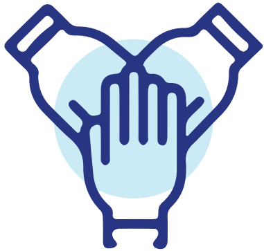
Figure 1: Vision for Recovery