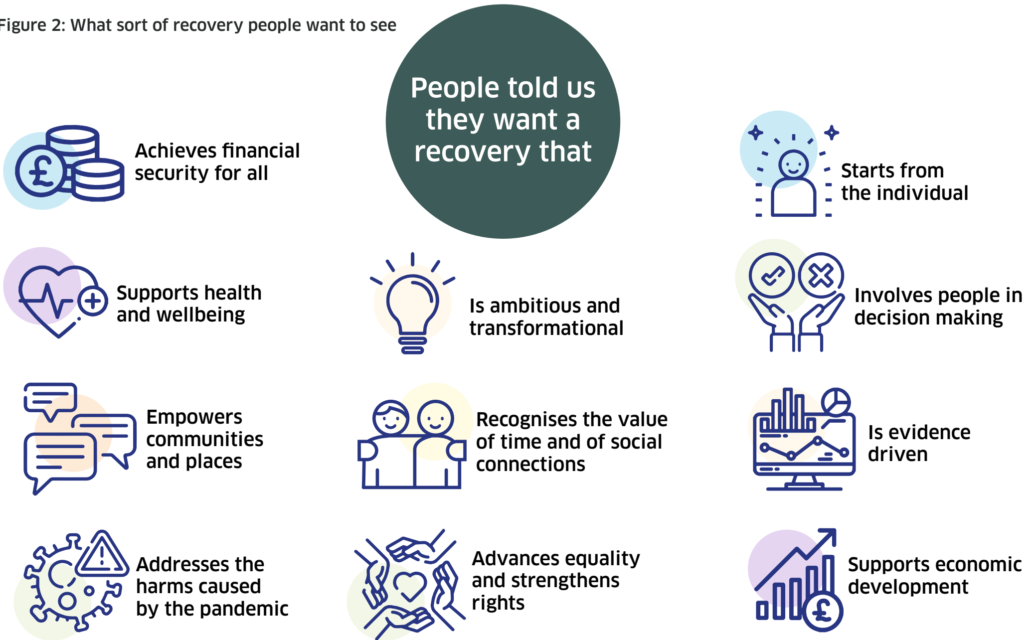
Figure 2: What sort of recovery people want to see