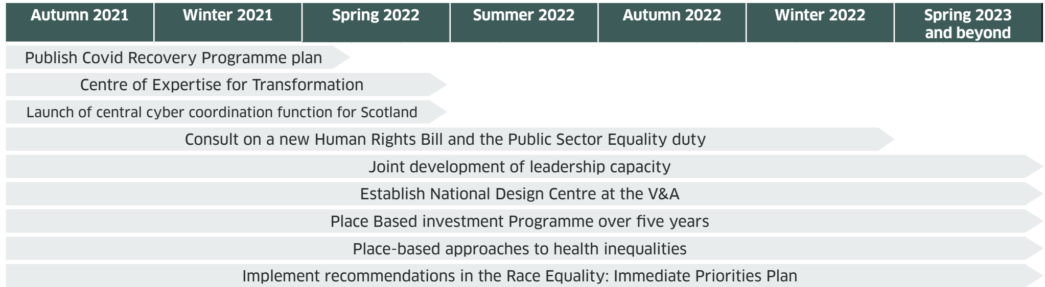
Figure 10: Strategy Delivery Plan for Rebuilding public services actions