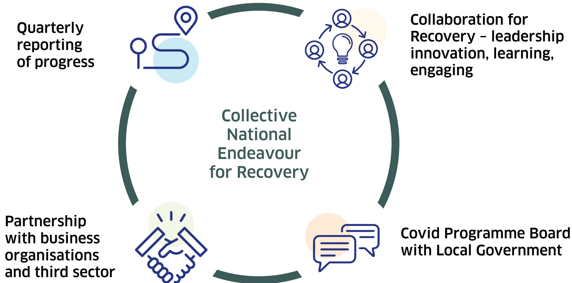
Figure 5: How will we measure progress?