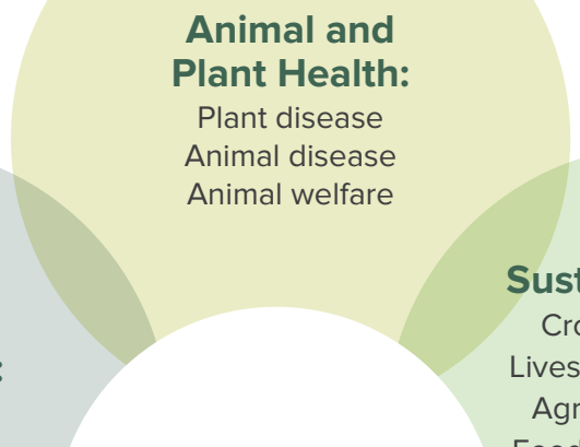
Figure 2. Research Themes and Topics.

In addition, we will prioritise research with other funding partners on animal and plant disease and climate change. The high-level drivers are relevant across many research areas, as are the cross-cutting themes (data science and behaviour change); hence proposals from any theme that best align with those drivers will be prioritised during evaluation. Moreover, the areas identified here present ongoing strategic research needs. The timing for project delivery will be outlined in more detailed documents, for example in the invitations to tender. Portfolio-wide prioritisation will remain an important signal to research providers and potential funding partners. The scientific strand of governance will update the prioritisation over the next funding cycle (see Section 7 ).