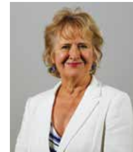
Roseanna Cunningham Cabinet Secretary for Environment, Climate Change and Land Reform

We now have a window of opportunity to change the way we think about protecting property from flooding. Greater resilience means less damage.