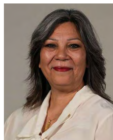
Kaukab Stewart MSP Minister for Equalities

This High Level Action Plan marks not the conclusion, but a continuation of our dialogue on the ICESCR Concluding Observations. We invite all those with an interest in advancing human rights to engage with the actions set out in this plan and to work with us as we take the next steps on Scotland's human rights journey. Our commitment to progressing economic, social, and cultural rights remains steadfast, and we will continue to collaborate with stakeholders, partners, and rights holders across Scotland to make those rights real.