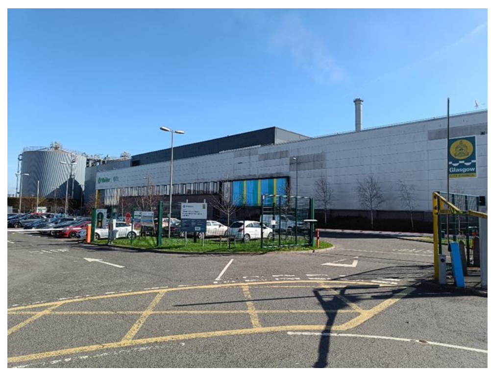
Figure 11. Glasgow Recycling and Renewable Energy Centre (GRREC)

Project secured grant funding to undertake a review of prior feasibility work to determine the potential for the Glasgow Recycling and Renewable Energy Centre (GRREC) to be used as a heat source for a district heat network serving a mix of domestic and non-domestic properties in the south side of Glasgow.