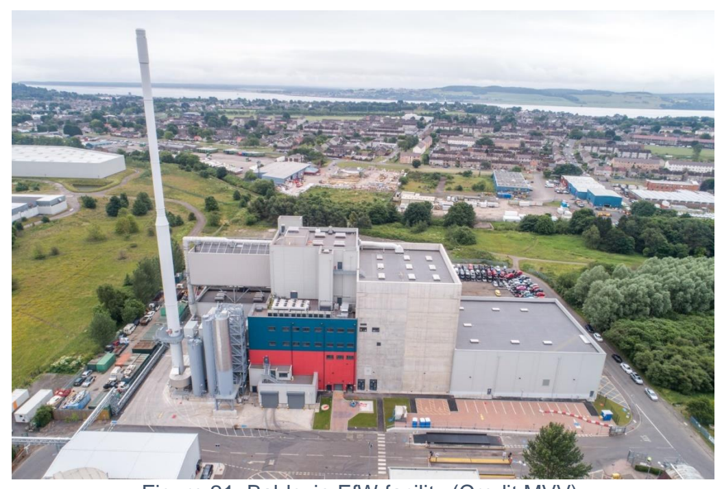
Figure 21. Baldovie EfW facility

This project proposes the creation of a heat network for the Whitefield and Douglas area with heat supply from the Baldovie Energy from Waste facility. The proposed heat network would supply a newbuild school with potential to extend the scheme towards Dundee City Centre.