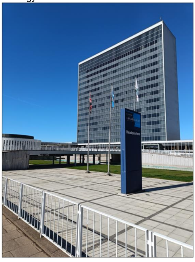
Figure 15. South Lanarkshire Council HQ Building

Proposed heat network centred around the council headquarters, and investigating the connection of several other non-domestic public sector properties, tower blocks and proposed new-build housing in the area. Ground source heat pumps are the recommended primary heat supply technology.