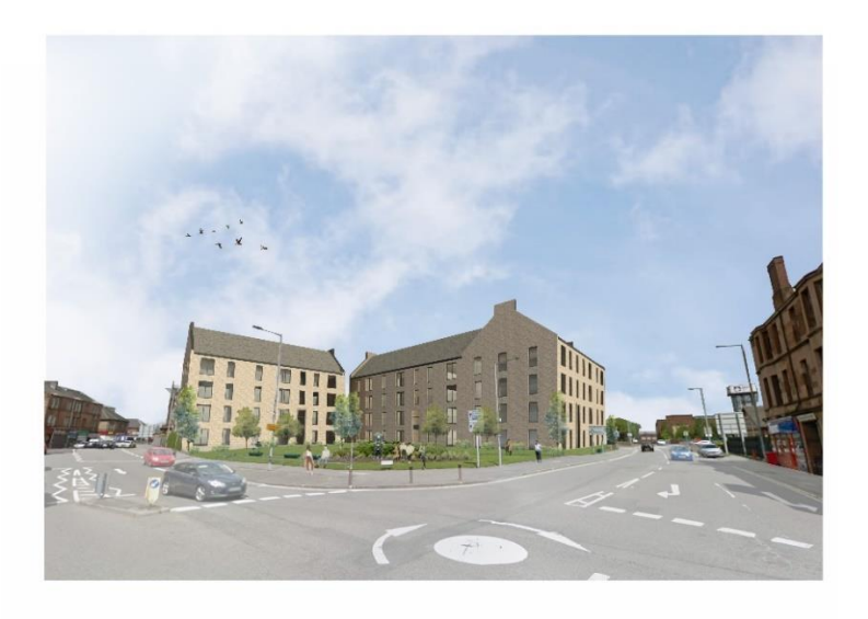
Figure 2. 3D image of North Lanarkshire Council's social housing project plan (© Coltart Earley Architects)

The project is due to begin construction in March 2023 and commission in May 2026.