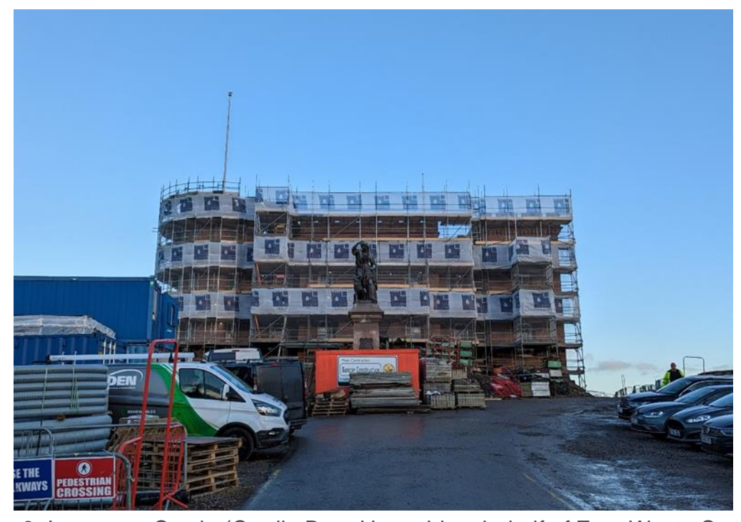
Figure 8. Inverness Castle

Highland Council are looking to develop a district heating network within the immediate area surrounding Inverness Castle which is a council administration centre. Potential heat sources include ground source heat pumps, river source heat pumps, sewer heat recovery, biomass and large scale air source heat pumps.