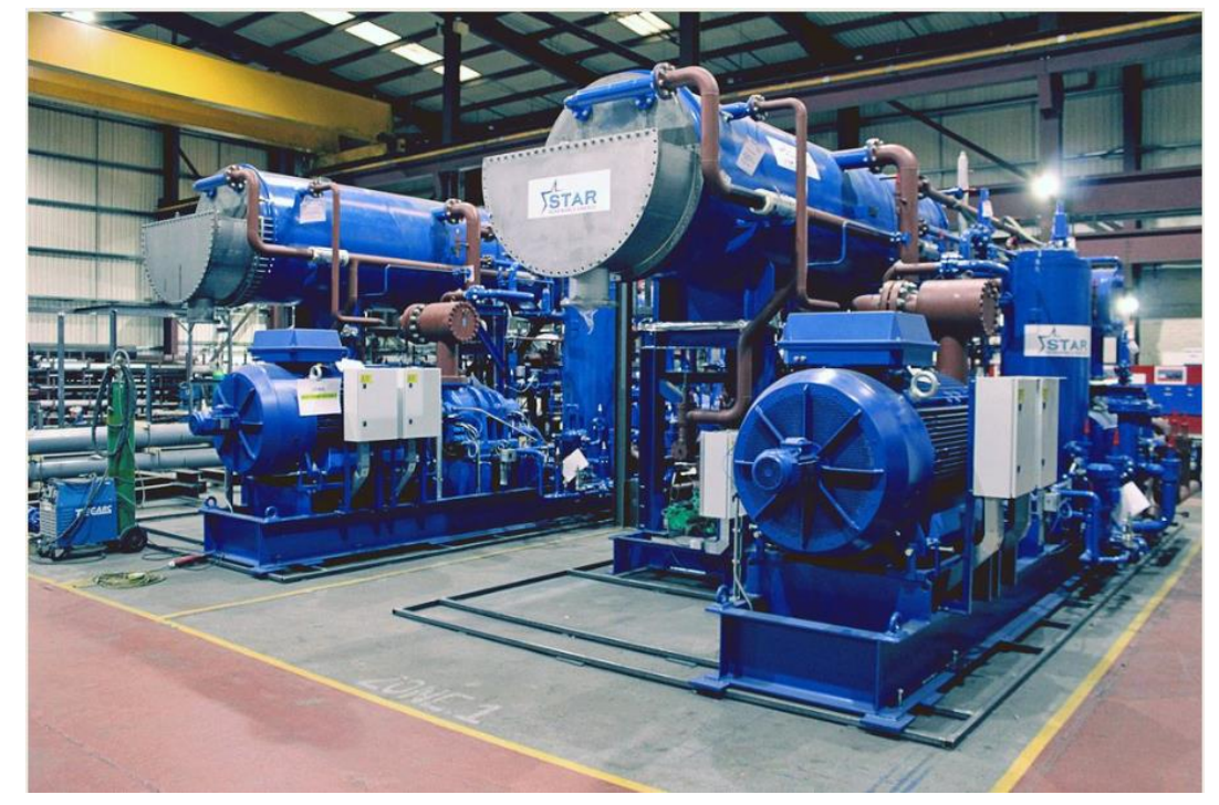
Figure 12. Queen's Quay Energy Centre

The project proposes the extension of the Queens Quay heat network to connect to the Golden Jubilee Hospital and hotel as well as nine of West Dunbartonshire Council's multiblock flats at Dalmuir and Littleholm (6 currently on electric, 3 on gas).