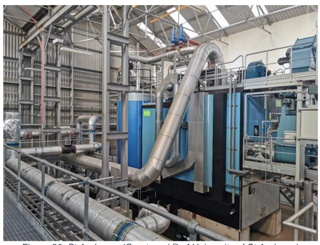
Figure 20. St Andrews

This project proposes the extension of an existing biomass heat network in and around St Andrews. Since its commissioning in 2017 the existing heat network, sourced by a 6.5MW biomass boiler has provided heating and hot water to 50 University campus buildings via 27 km of pipe, accumulating savings of 20,000 tCO2e. The feasibility study will explore different options to identify a preferred extension scenario, which could include public sector buildings, schools and hospitality venues.