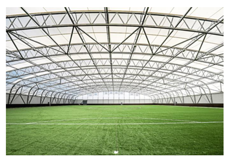
Figure 6. Regional Performance Centre, Dundee

The Caird Park project was originally supported by the Low Carbon Infrastructure Transition Programme. A pre-feasibility study to expand the network was published in January 2022 as part of an initiative to boost heat networks by the Scottish Cities Alliance. This study analysed opportunities to expand the existing network towards additional heating loads (a school, a college, a sports centre and a gymnastics centre). The project aims to deliver these expansions to their heat network.