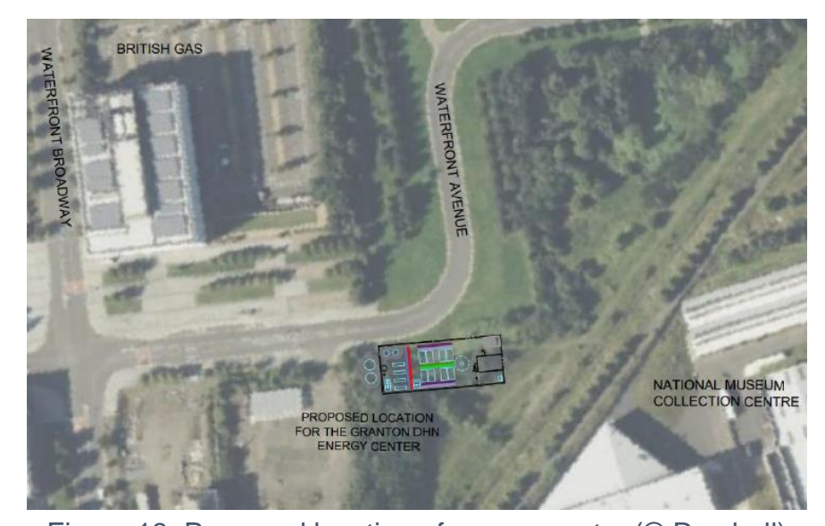
Figure 13. Proposed location of energy centre

The project proposes a new heat network to serve new buildings on the Granton development site. The site is of mixed use with approx 3000 homes and 9,000m² non-domestic space, including a primary school, medical centre, business, retail and leisure. The projects looks to create the heat network with the potential to connect to nearby areas of heat demand to the south of site including existing schools and a leisure centre.