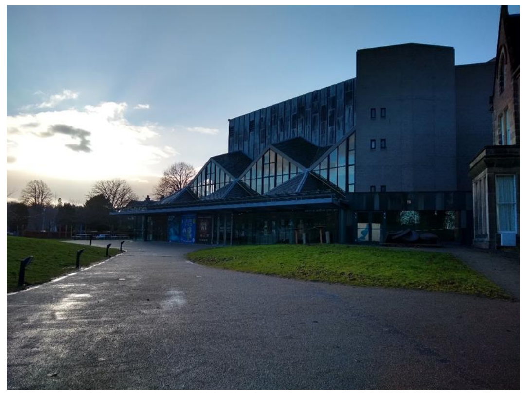
Figure 7. Eden Court and the Highland Council offices, Inverness

The Highland Council are looking to establish district heating networks within Inverness. The main buildings identified for connection include Inverness Leisure Centre, Inverness Ice Centre, Highland Archive and Registration Centre, Inverness Botanic Gardens, Highland Council HQ and Eden Court.