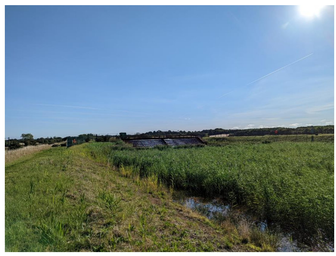
Figure 16. Water treatment reed bed lagoons at minewater site

The project involves a quarry and mine regeneration scheme creating new-build residential and commercial properties. A suggested approach is recovering heat from minewater which will be fed through an ambient loop to households each of which will have individual heat pumps.