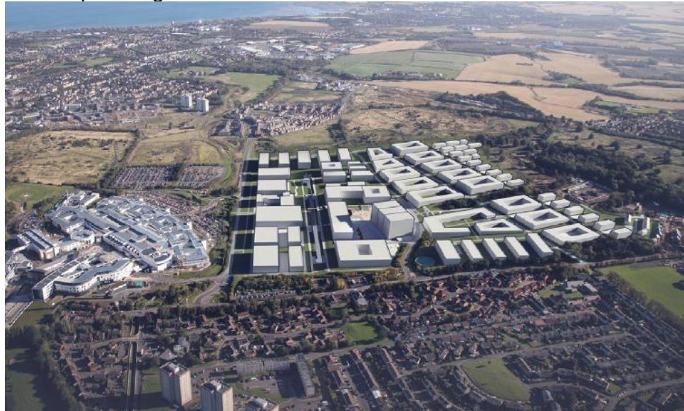
Figure 5. Aerial view of the Edinburgh BioQuarter site (Credit: Oberlanders Architects)

The project explores the supply of heat to the Edinburgh BioQuarter site via a heat network. This is proposed to serve new buildings on Edinburgh's BioQuarter site masterplan, with connection to existing buildings on site in due course, including the NHS Royal Infirmary of Edinburgh and the Royal Hospital for Children and Young People, and the potential to serve social housing off-site. The feasibility study examines the potential for a new heat network or connection to the upcoming Shawfair Heat Network in Midlothian.