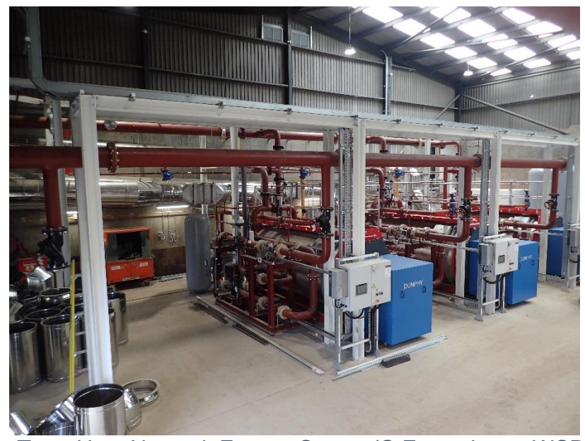
Figure 3. Torry Heat Network Energy Centre

The second phase is due to commission in March 2026.