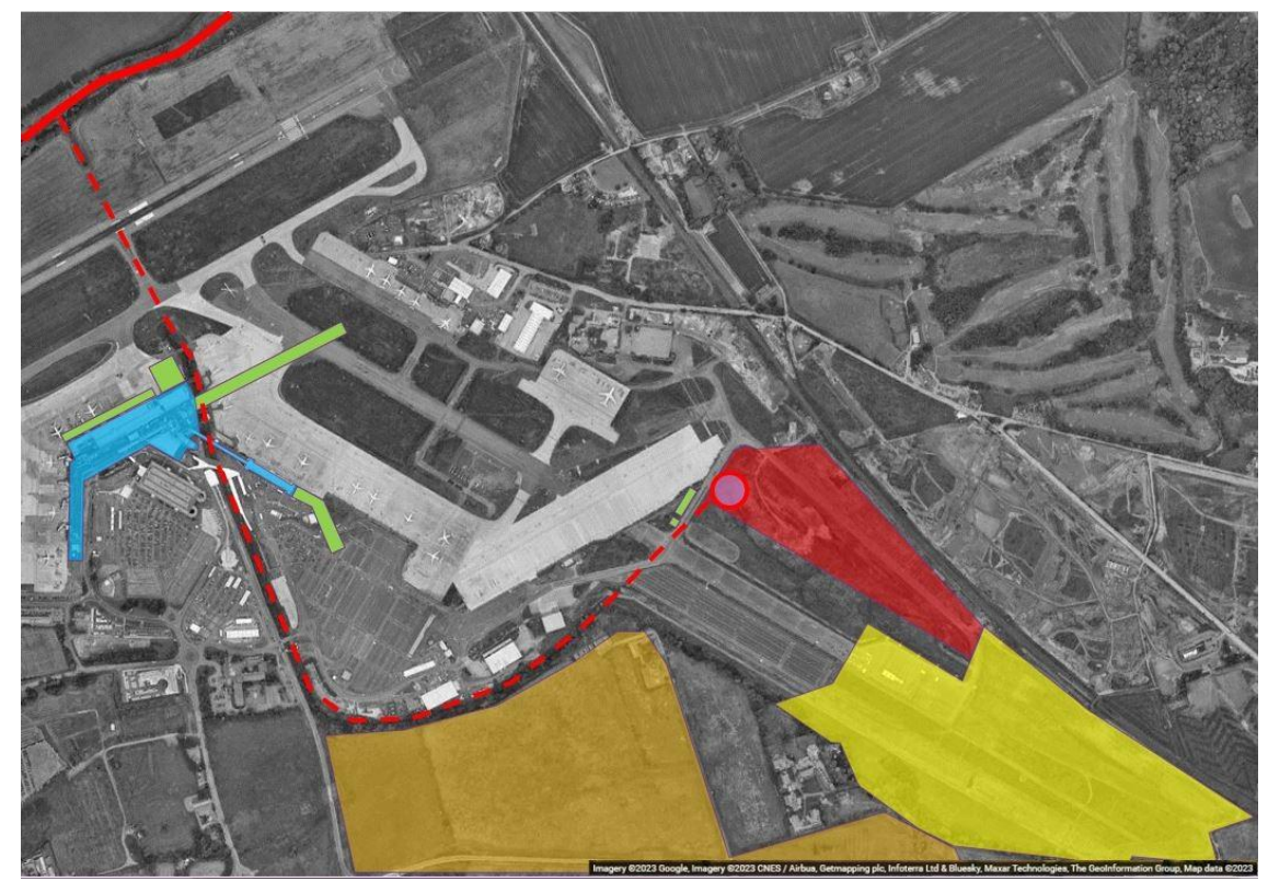
Figure 14. Aerial view of Edinburgh Airport Heat Network proposed scale

The project will develop the technical and economic case for a district heat network which would supply heat to Edinburgh Airport, while acknowledging opportunities for future expansion to the Crosswinds and West Town developments (eg with regard to energy centre/pipe sizing).