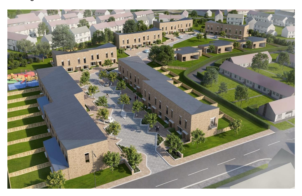
Figure 4. Aerial view of the Kaimhill Development site in Garthdee

The project will install a zero direct emissions heat network consisting of a shared ground array with heat pumps to provide affordable heat to 35 new homes at the Kaimhill development site in Garthdee, Aberdeen. The 35 homes will be comprised of a mix of 3 or 4 bedroom terraced houses and bungalows and are part of Aberdeen City Council's social housing stock.