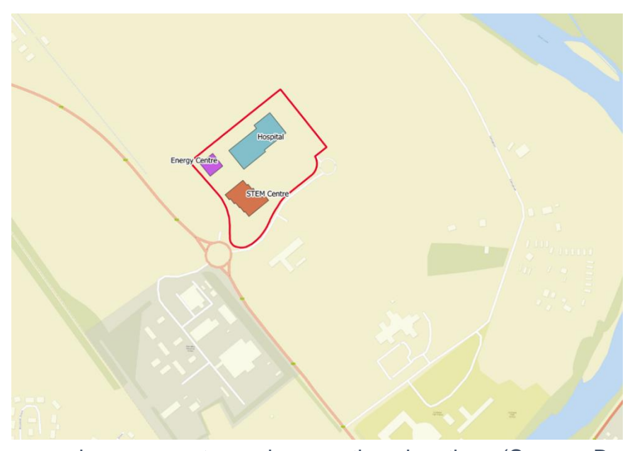
Figure 10. Proposed energy centre and connections locations

Proposed heat network to serve the Blar Mhor development site, including connections to the proposed STEM centre for UHI – West Highland College and NHS General Highland hospital. Air source and ground source heat pumps are being considered as heat supply technology.