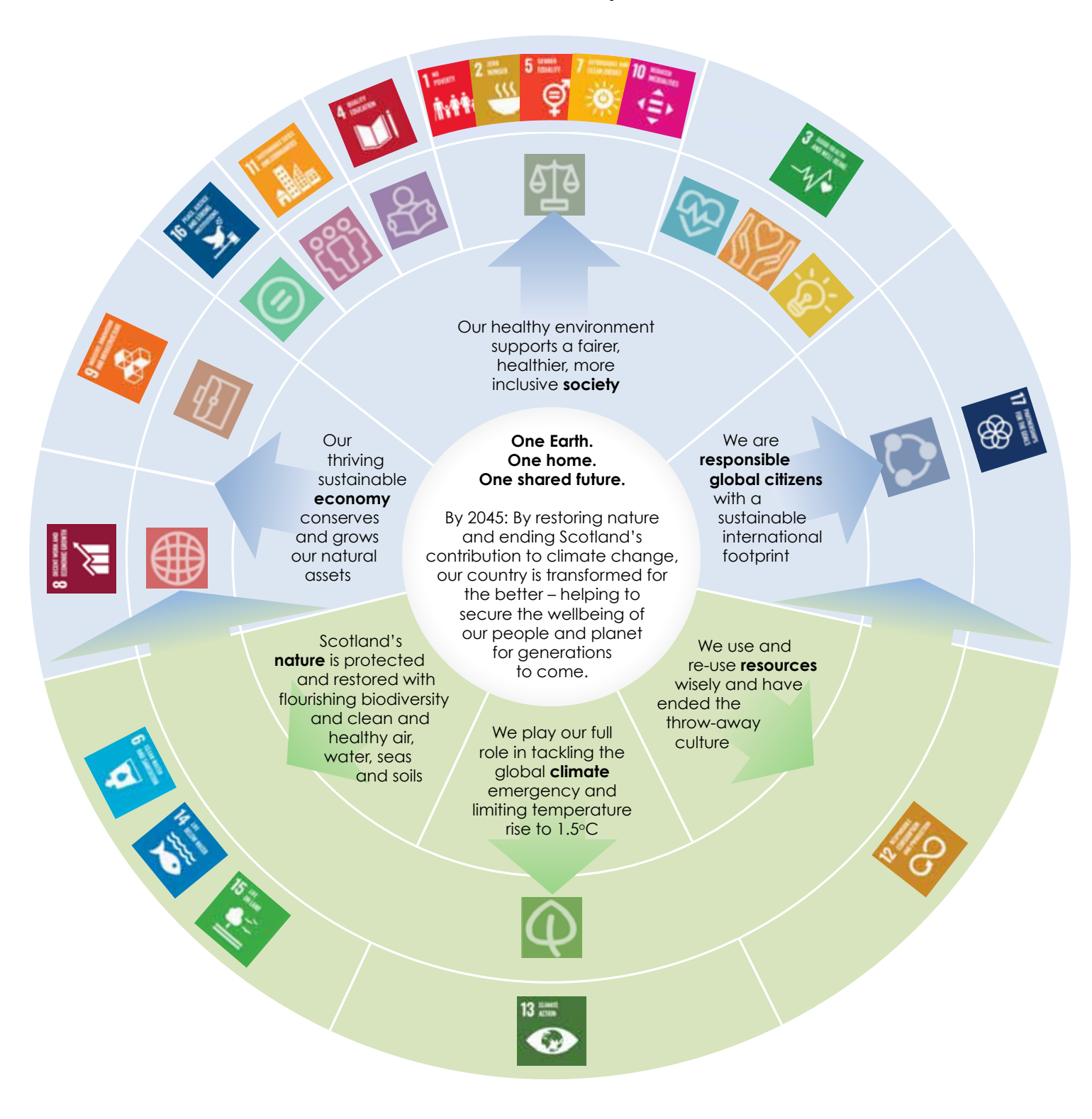
Figure 1: Contribution of the Environment Strategy vision and outcomes to National Outcomes and UN Sustainable Development Goals