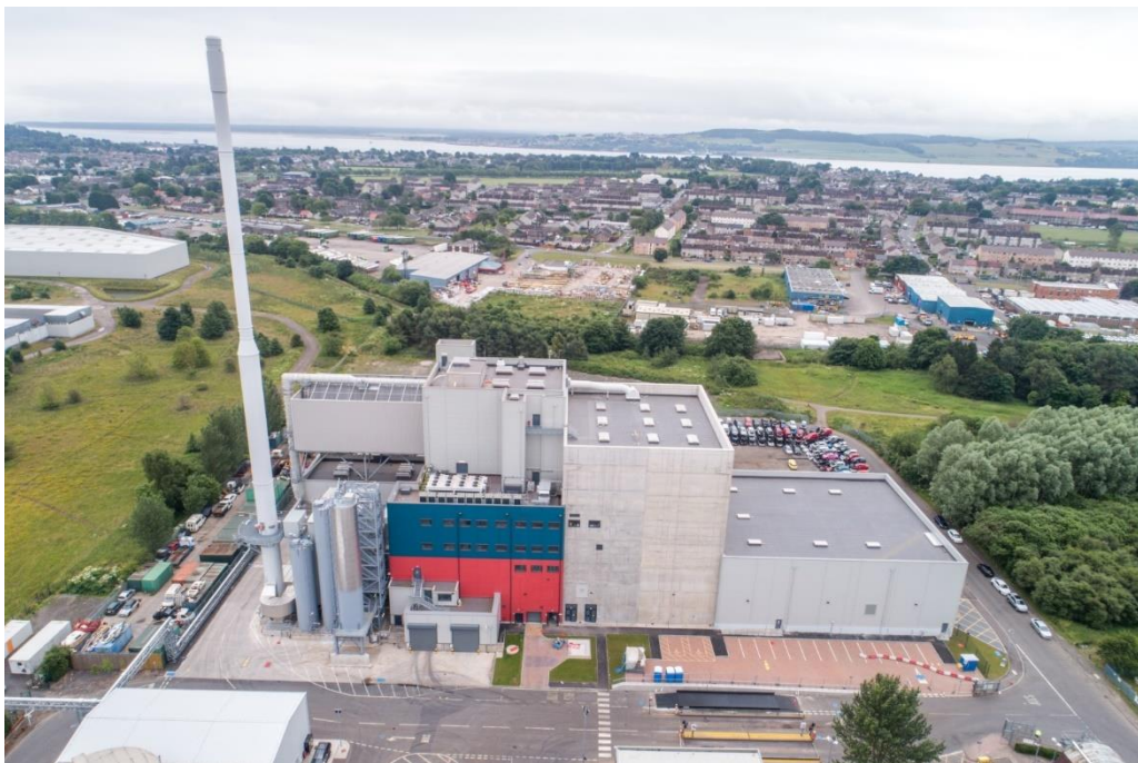
Figure 21. Baldovie EfW facility

This project proposes the creation of a heat network for the Whitefield and Douglas area with heat supply from the Baldovie Energy from Waste facility. The study will assess potential anchor loads in the vicinity of the Energy from Waste facility, and the potential to extend towards the city centre.