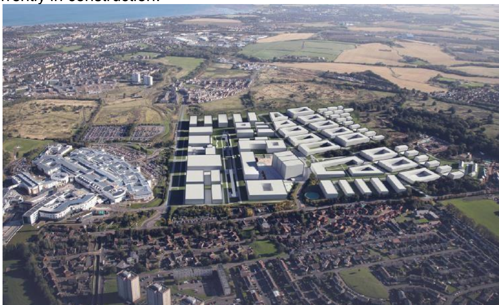
Figure 5. Aerial view of the Edinburgh BioQuarter site (Credit: Oberlanders Architects)

The project explores the supply of heat to the Edinburgh BioQuarter site via a heat network. This is proposed to serve new buildings on Edinburgh's BioQuarter site masterplan, with connection to existing buildings on site in due course, including the NHS Royal Infirmary of Edinburgh and the Royal Hospital for Children and Young People, and the potential to serve social housing off-site. The feasibility study examines the potential for a new heat network and potential connection to Midlothian Energy Limited's Heat Network, the first phase of which is currently in construction.