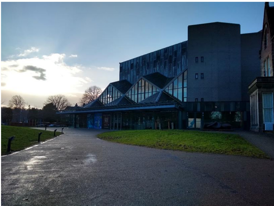
Figure 7. Eden Court and the Highland Council offices, Inverness

The Highland Council are looking to establish district heating networks within Inverness. The main buildings identified for connection include Inverness Leisure Centre, Inverness Ice Centre, Highland Archive and Registration Centre, Inverness Botanic Gardens, Highland Council HQ and Eden Court.