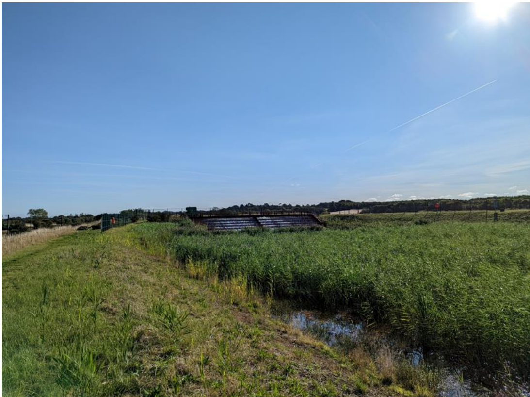
Figure 16. Water treatment reed bed lagoons at minewater site

Project description: The project involves the redevelopment of a former quarry and mine for new-build residential, public and commercial properties. A suggested approach is recovering heat from minewater, which will be fed through an ambient loop to households, each of which will have individual heat pumps.