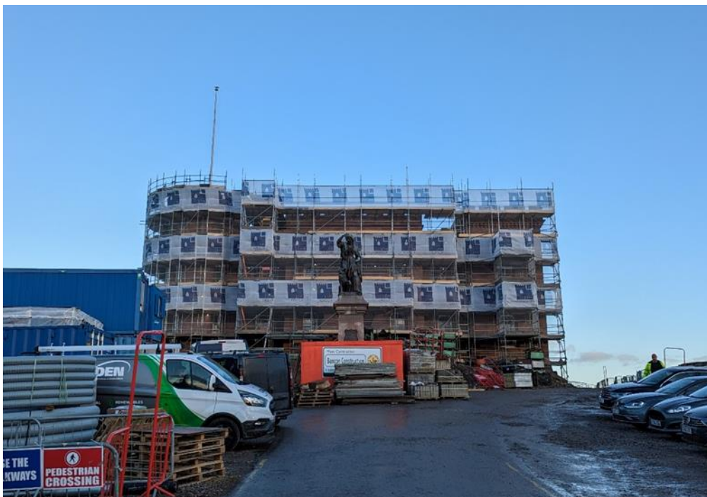
Figure 8. Inverness Castle

Project description: Highland Council are looking to develop a district heating network within the immediate area surrounding Inverness Castle which is a council administration centre. Potential heat sources include ground source heat pumps, river source heat pumps, sewer heat recovery, biomass and large scale air source heat pumps.