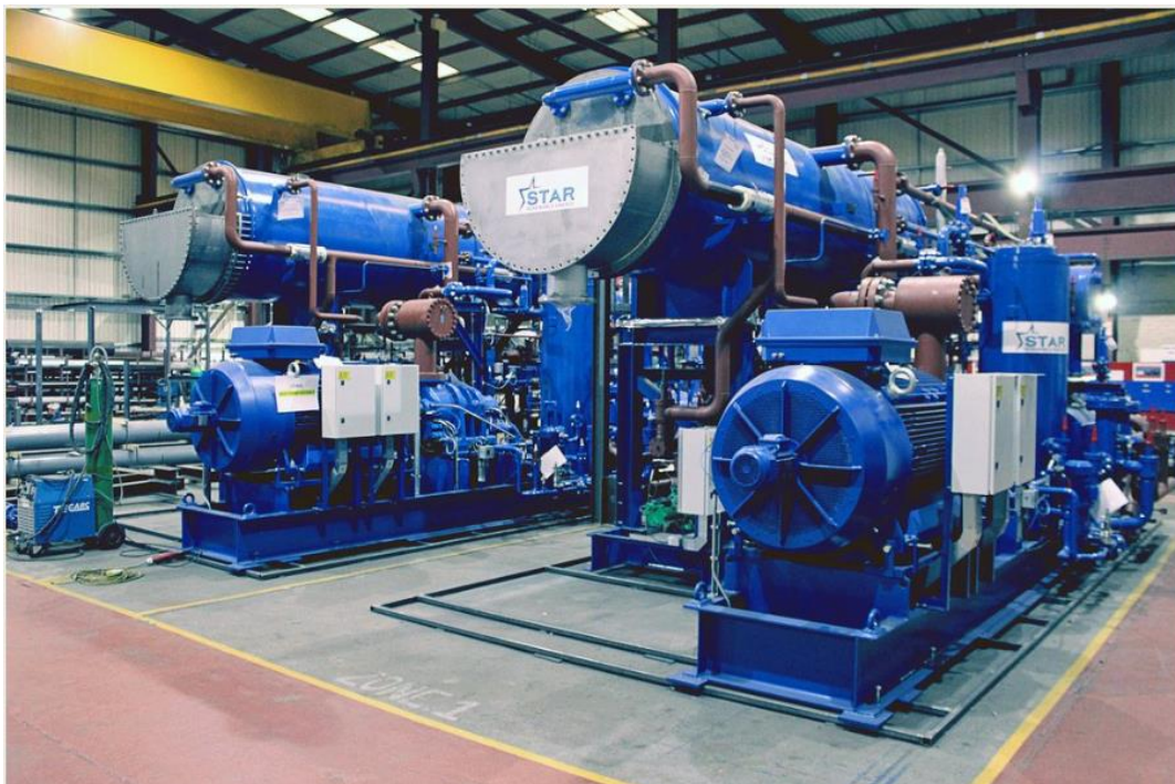
Figure 12. Queen's Quay Energy Centre

The project proposes the extension of the Queens Quay heat network to connect to the Golden Jubilee Hospital.