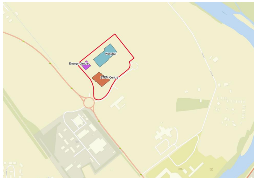
Figure 10. Proposed energy centre and connections locations

Proposed heat network to serve the Blar Mhor development site, including connections to the proposed STEM centre for UHI – West Highland College and NHS General Highland hospital. Air source and ground source heat pumps are being considered as heat supply technology.