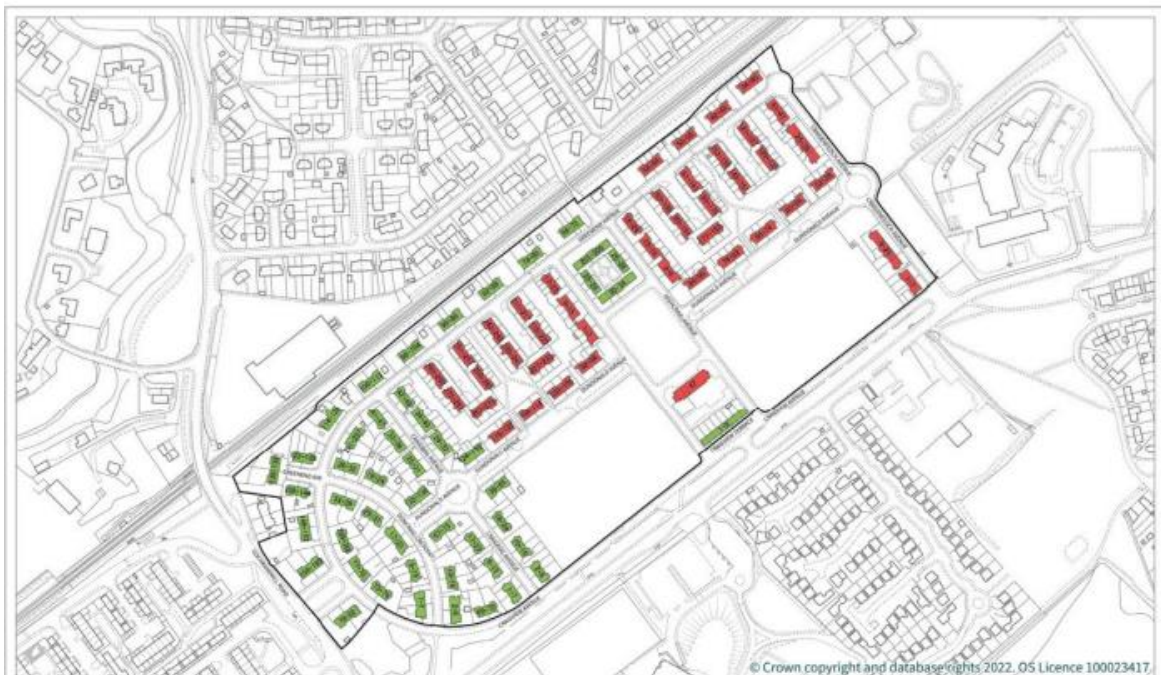
Figure 22. Howwood Road

Renfrewshire Council are planning a housing led Regeneration and Renewal Programme within 8 areas of Renfrewshire. Within the Howwood Road area, an estate which currently contains 371 residential properties has been selected to undergo extensive regeneration works. The HNSU are supporting pre-feasibility work to explore a district heating solution for this area and gain a better understanding of the size of the opportunity.