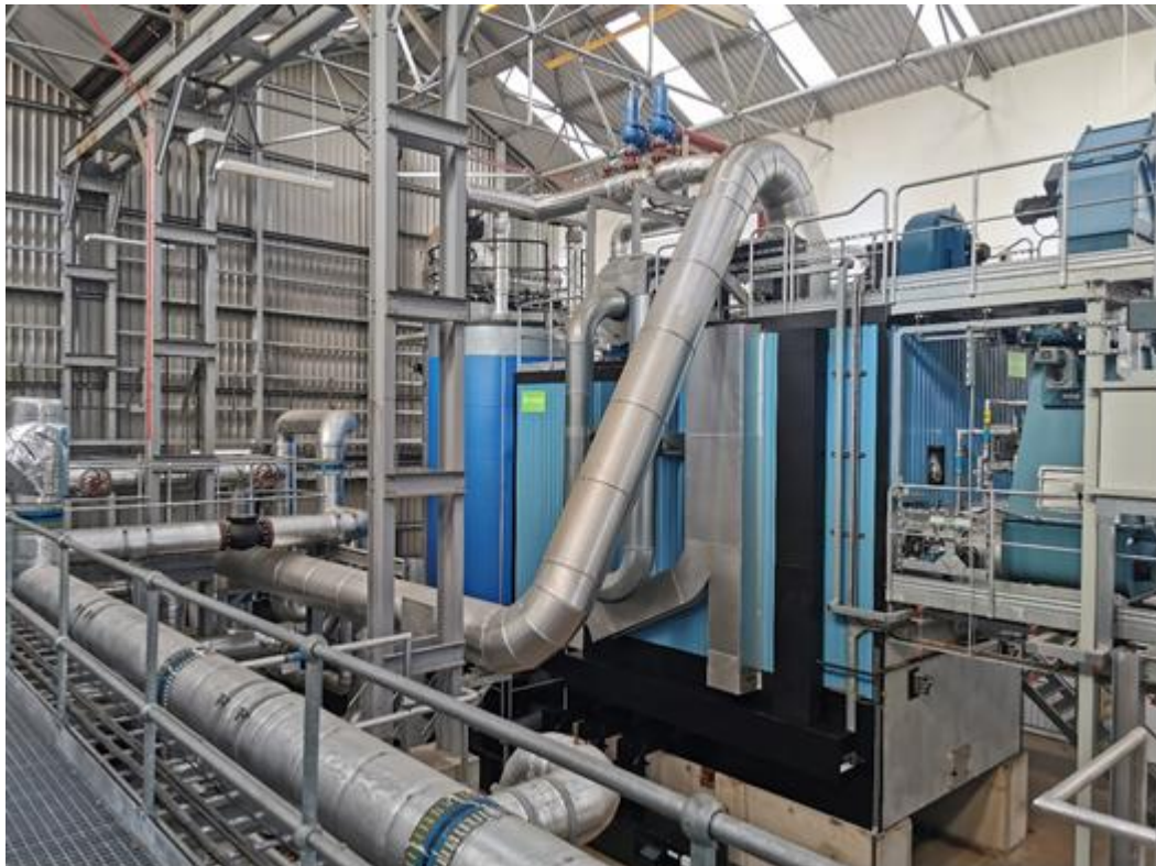
Figure 20. St Andrews

This project proposes the extension of an existing biomass heat network in and around St Andrews. Since its commissioning in 2017 the existing heat network, sourced by a 6.5MW biomass boiler has provided heating and hot water to 50 University campus buildings via 27 km of pipe, accumulating savings of 20,000 tCO 2 e. The feasibility study will explore different options to identify a preferred extension scenario, which could include public sector buildings, schools and hospitality venues.