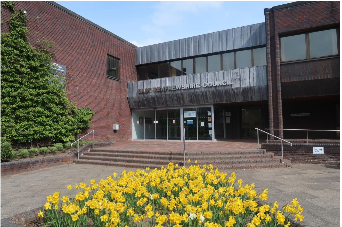
Figure 19. Example of Eastwood Park Council building

This project proposes a new heat network with sewer water heat recovery as a potential source. The proposed heat network would supply public sector buildings including Eastwood Park Campus, schools and a leisure centre.