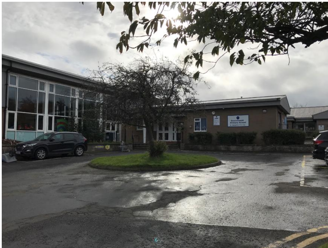
Figure 17. Gracemount Primary School (Credit: Buro Happold on behalf of Zero Waste Scotland)

Network for public sector buildings including council-owned offices, an NHS health centre and an Edinburgh Leisure building in close proximity. The project proposes using both air source and ground source heat pumps to provide low carbon heat.