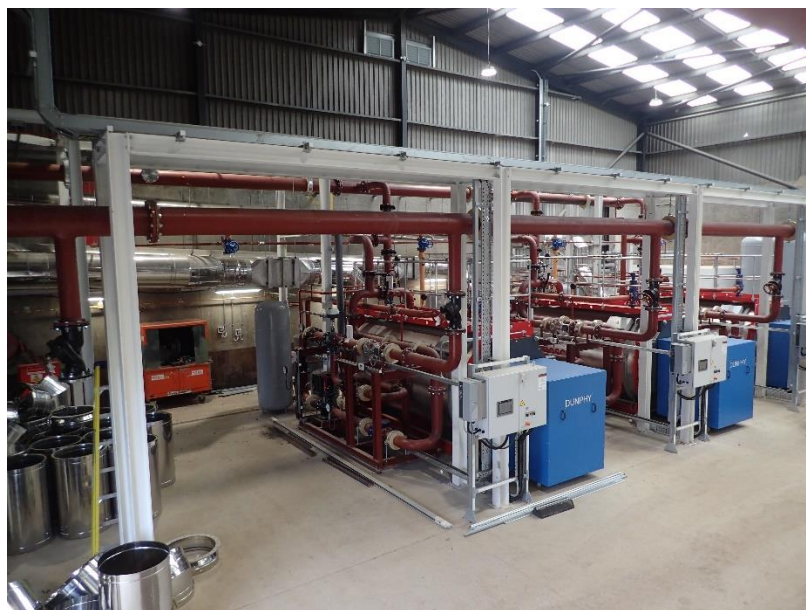
Figure 3. Torry Heat Network Energy Centre

The second phase is due to commission in March 2026.