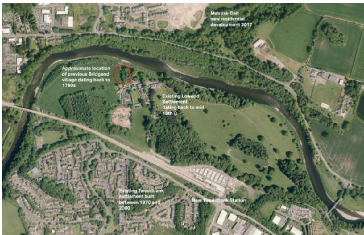
Figure 28. Tweedbank project area

Scottish Borders Council are looking to develop a new heat network that serves a mixed-use development. This development includes 300-400 properties, a community centre, care village and business space. Tweedbank is a key anchor load and there is potential to expand west to Galashiels and east to Melrose. There is also potential to extend to the town centre, towards the new Falkirk Town Hall.