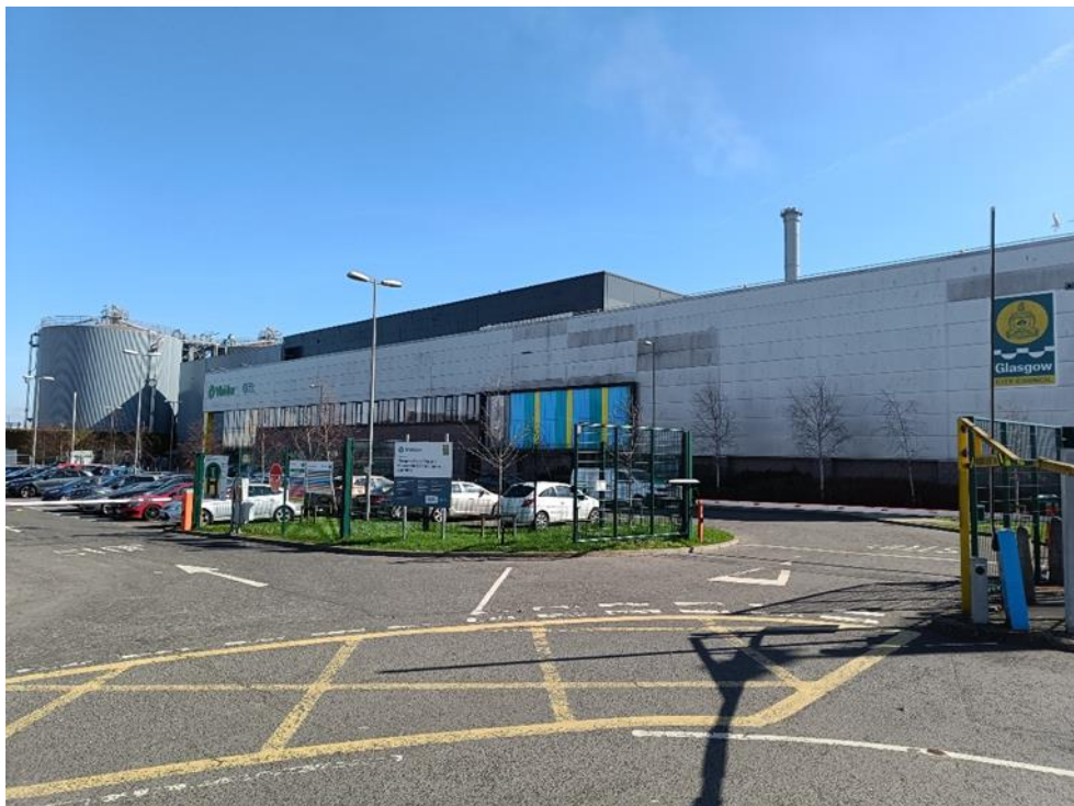
Figure 11. Glasgow Recycling and Renewable Energy Centre (GRREC)

Project description: Project secured grant funding to undertake a review of prior feasibility work to determine the potential for the Glasgow Recycling and Renewable Energy Centre (GRREC) to be used as a heat source for a district heat network serving a mix of domestic and non-domestic properties in the south side of Glasgow.