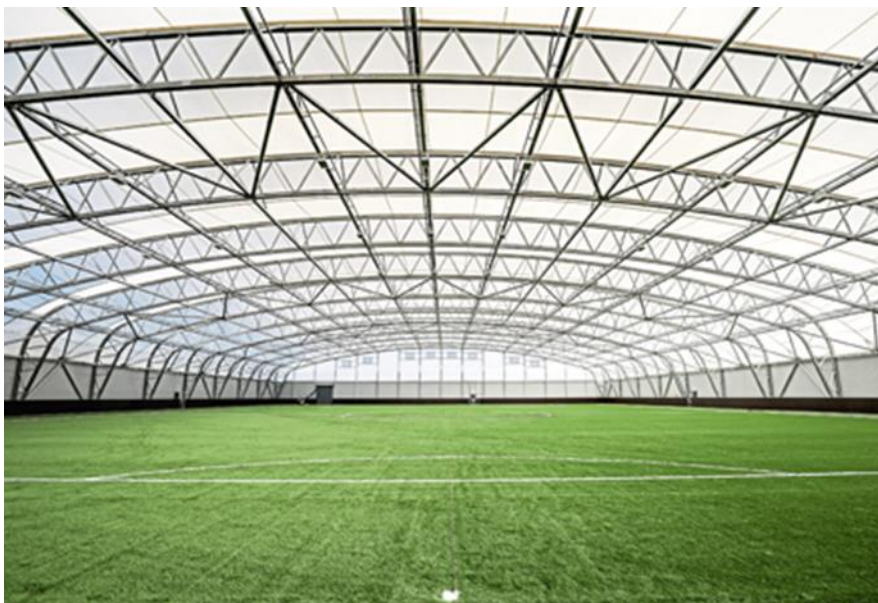
Figure 6. Regional Performance Centre, Dundee (Credit: Dundee City Council)

Project description: The Caird Park project was originally supported by the Low Carbon Infrastructure Transition Programme. A pre-feasibility study to expand the network was published in January 2022 as part of an initiative to boost heat networks by the Scottish Cities Alliance. This study analysed opportunities to expand the existing network towards additional heating loads (a school, a college, a sports centre and a gymnastics centre). The project aims to assess the viability of these additional connections.