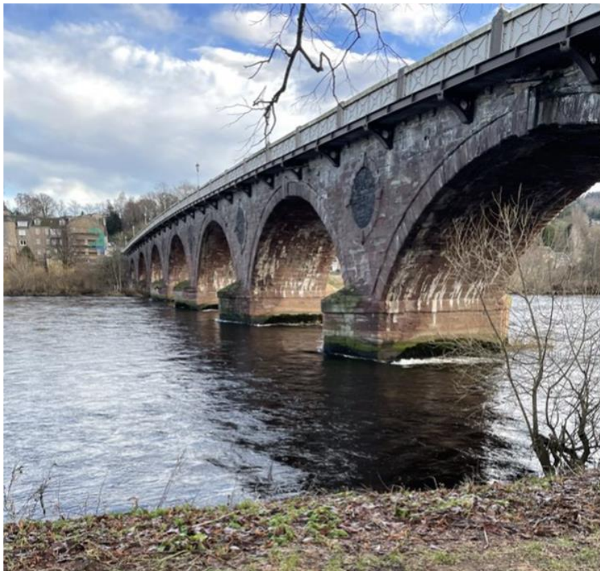
Figure 9. River Tay

Various non-domestic and domestic buildings including a concert hall, council offices, tower blocks and a hotel have been identified within Perth city centre that are potential connections for a heat network. A range of low carbon heat sources are recommended to be considered including river and ground source heat pumps.