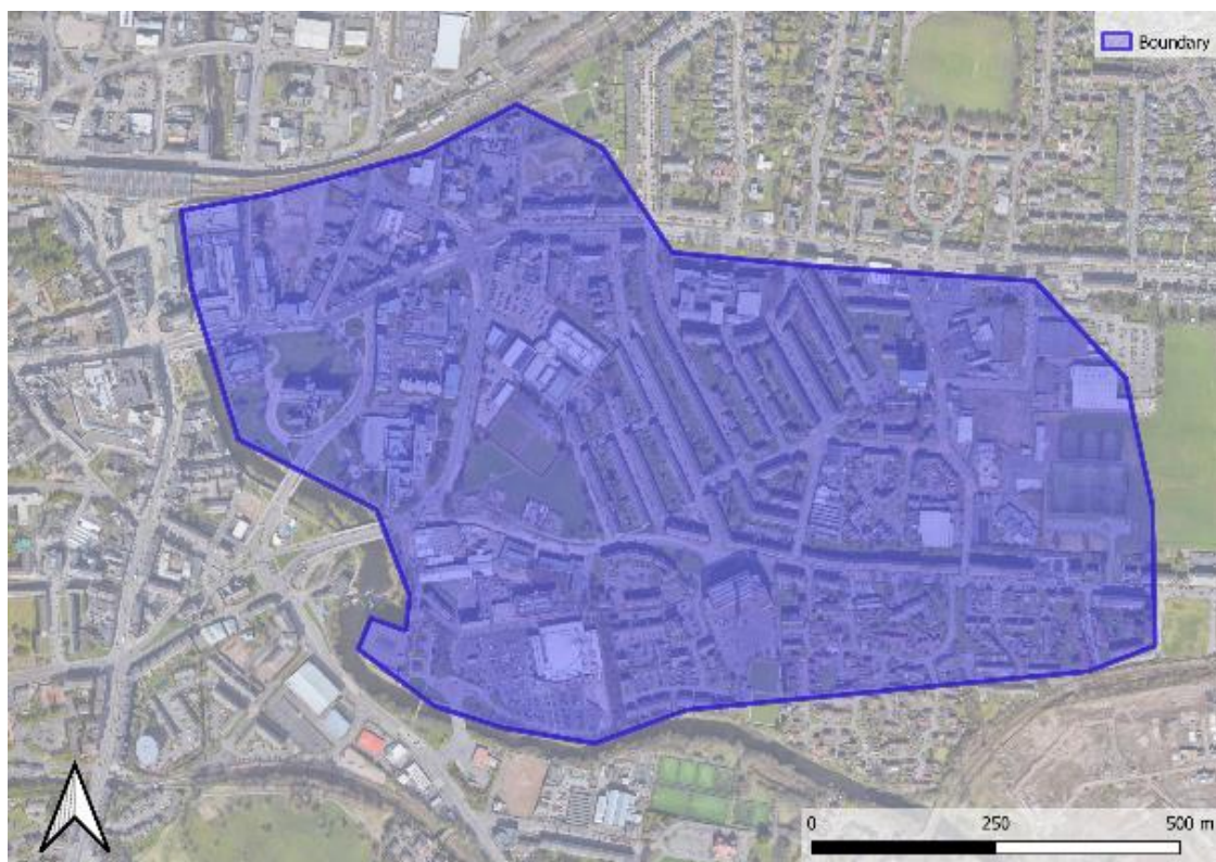
Figure 24. Paisley East (Credit: Buro Happold). Background satellite imagery © 2023 Google

Paisley Council are looking to develop a district heating network in Paisley East connecting the Town Hall, Paisley Abbey, Renfrewshire House, Lagoon Leisure Centre, Police station and some council-owned residential housing. Potential heat sources include wastewater heat recovery, river, ground and air source heat pumps.