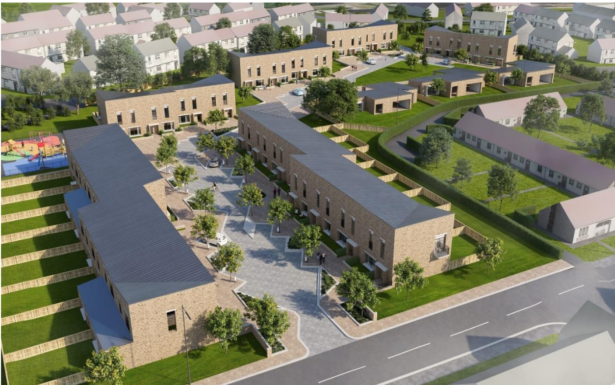
Figure 4. Aerial view of the Kaimhill Development site in Garthdee

Project description: The project will install a zero direct emissions heat network consisting of a shared ground array with heat pumps to provide affordable heat to 35 new homes at the Kaimhill development site in Garthdee, Aberdeen. The 35 homes will be comprised of a mix of 3 or 4 bedroom terraced houses and bungalows and are part of Aberdeen City Council's social housing stock.