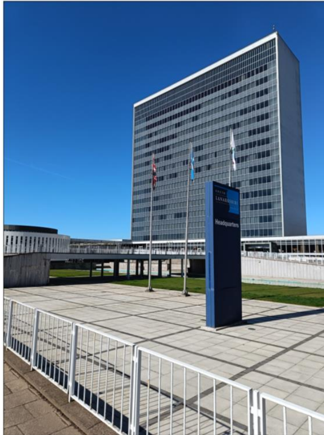
Figure 15. South Lanarkshire Council HQ Building

Proposed heat network centred around the council headquarters, and investigating the connection of several other non-domestic public sector properties, tower blocks and proposed new-build housing in the area. Ground source heat pumps are the recommended primary heat supply technology.