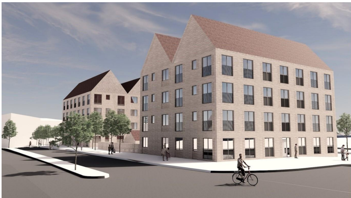
Figure 1. 3D Image of Lowther Homes affordable housing development plan (Credit: Collective Architecture)

The project began on site in October 2023 and complete in April 2025.