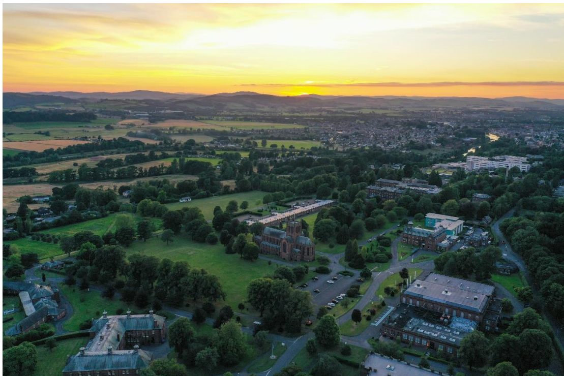
Figure 29. Crichton Trust Estate

The Crichton Trust are looking to develop a new heat network that serves the mixed-use buildings on Crichton Estate, Dumfries and Galloway College, Scottish Rural Agricultural College, Brownhill Primary School, 3 NHS buildings and domestic properties. Potential heat sources include ground source heat pump, river source heat pump and wastewater treatment plant.