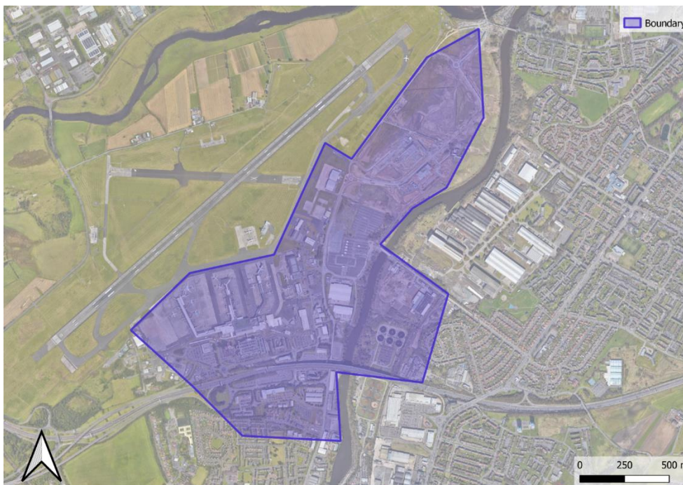
Figure 26. Paisley North (Credit: Buro Happold). Background satellite imagery © 2023 Google

Paisley Council are looking to extend the existing AMIDS heat network in Paisley South with the proposed area being Paisley North. Potential connections include Glasgow International Airport, hotels south of the airport, education buildings and future industrial buildings at the AMIDS development. The existing AMIDS heat source is a wastewater treatment works. Alternative (or additional) heat sources include river, ground and air source heat pumps.