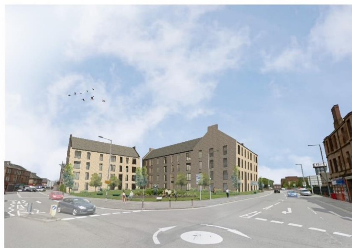
Figure 2. 3D image of North Lanarkshire Council's social housing project plan (© Coltart Earley Architects)

The project began construction in March 2023 and commission in August 2024.