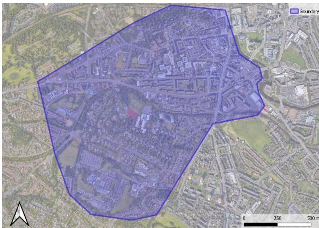
Figure 25. Paisley West (Credit: Buro Happold). Background satellite imagery © 2023 Google

Paisley Council are looking to develop a district heating network in Paisley West. Potential connections include the University of the West of Scotland, Piazza shopping centre, Hotel planned near Barga, Castlehead Highschool, Royal Alexandria Hospital, planned new development around Paisley shopping centre and museum and residential areas. Potential heat sources include wastewater heat recovery, river, ground and air source heat pumps.