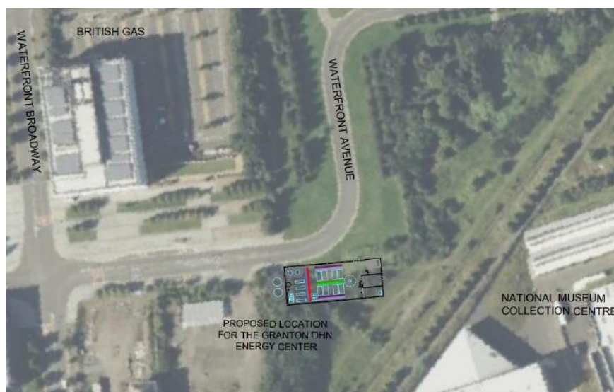
Figure 13. Proposed location of energy centre

The project proposes a new heat network to serve new buildings on the Granton development site. The site is of mixed use with approx 3000 homes and 9,000m 2 non-domestic space, including a primary school, medical centre, business, retail and leisure. The projects aims to create the heat network with the potential to connect to nearby areas of heat demand to the south of the site, including existing schools and a leisure centre.