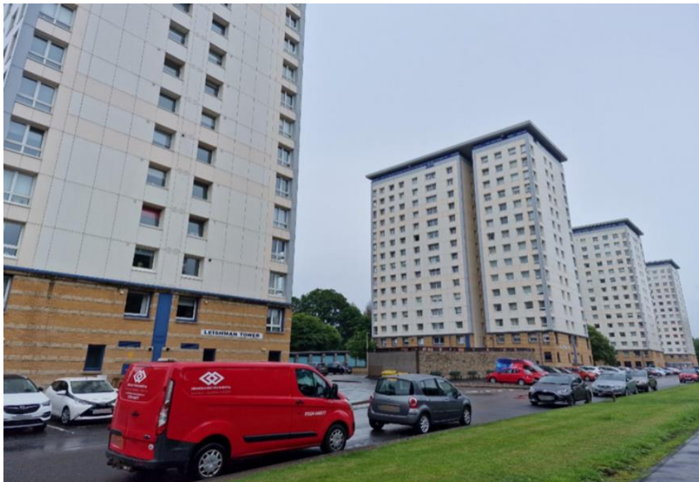
Figure 27. Callendar Park – Existing Social Housing Tower Connections

Falkirk Council is looking to upgrade and extend an existing gas CHP heat network in the Callendar Park area. The CHP system currently powers 9 of the 11 tower blocks in the area and requires upgrading in the next 5 years. The proposed extension would power the existing 9 tower blocks, in addition to Callendar Business Park and two local schools. There is also potential to extend to the town centre, towards the new Falkirk Town Hall.