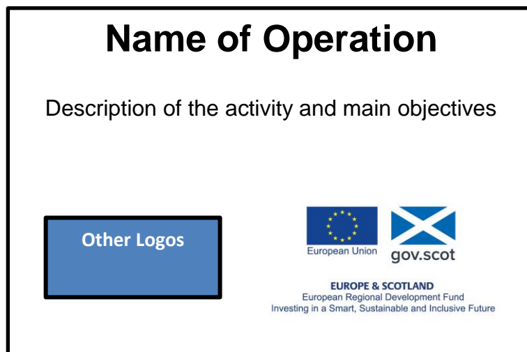
Figure 1. Billboard: