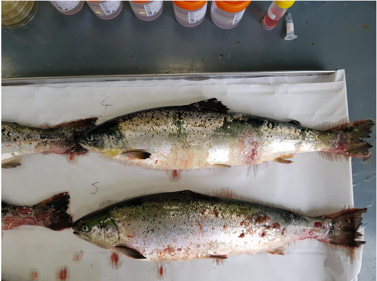
F4 – F5