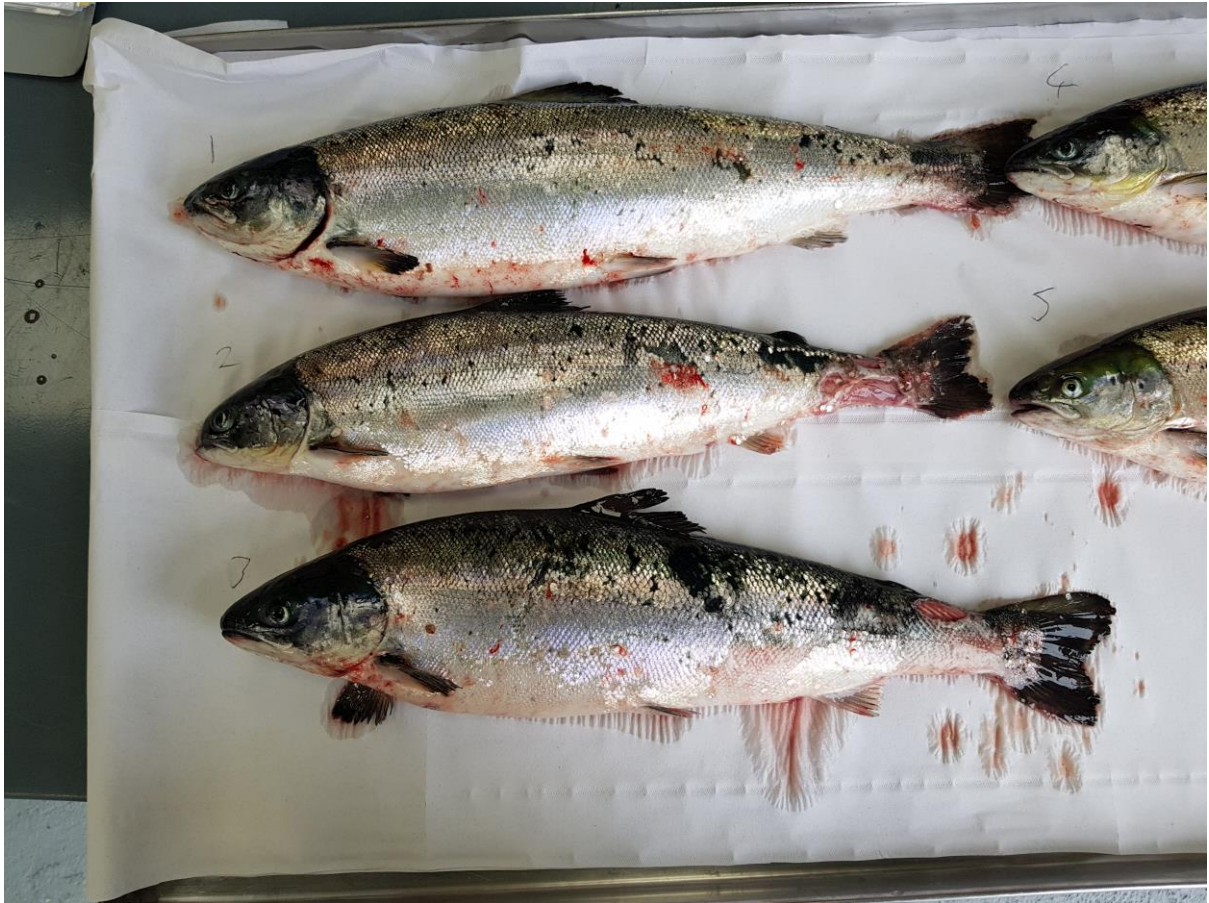
F1 – F3