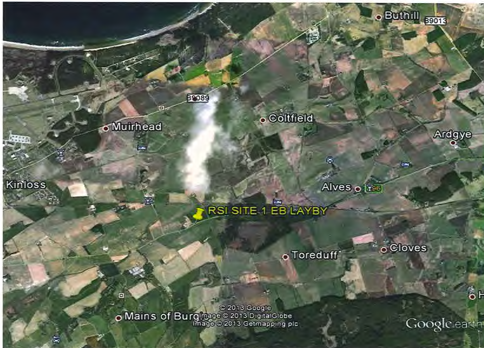
Diagram No: 1

Sites/ Locations: 1 - A96 Forres to Elgin (Eastbound)