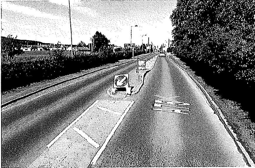
Crocketford Southern gateway island feature – July 2016