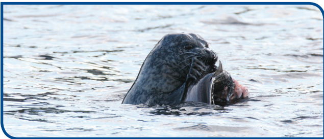
FIGURE 3. A COMMON SEAL EATING A SALMON