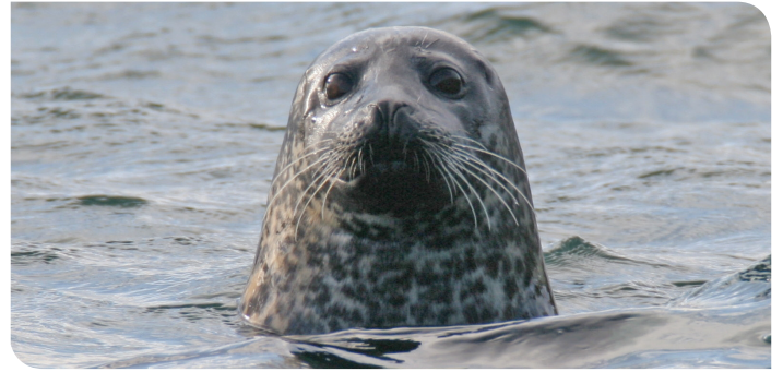
COMMON SEAL (CREDIT: A CORAM SMRU).