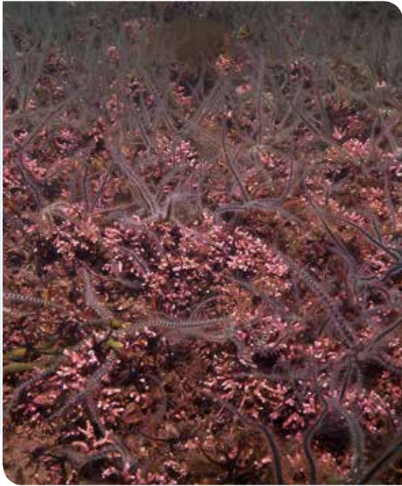
LOCH SWEEN MAERL BED