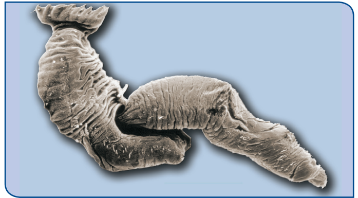
GYRODACTYLUS SPP. GIVING BIRTH