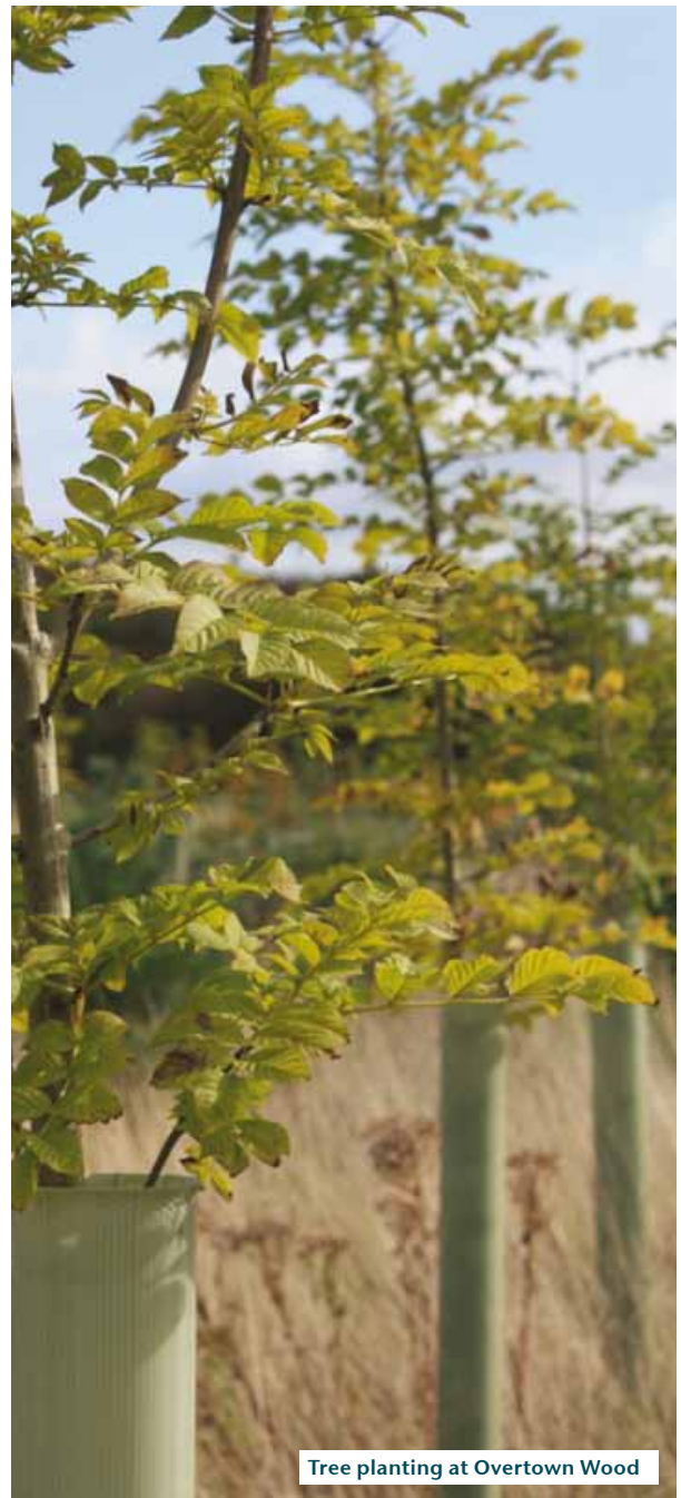
Tree planting at Overtown Wood

c) Development should seek to work in harmony with the landscape setting, respond to the underlying landform and follow contours in order to integrate successfully into the landscape with the objective of minimising the visual and landscape impact on surrounding areas. Proper consideration should be given to existing landscape character, key views and features particularly to the eastern edge of the site. Existing hedgerows in the northern part of the site should be reinforced where practical.