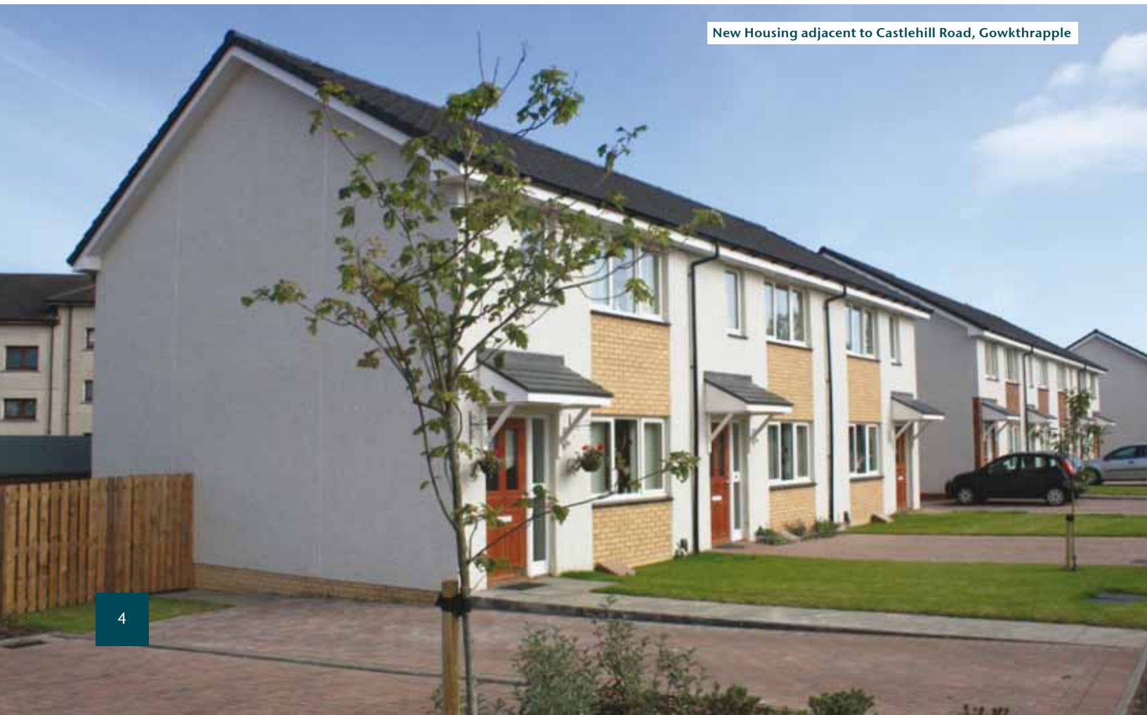
New Housing adjacent to Castlehill Road, Gowkthrapple

The CGA will include not only housing, but other facilities that may be required to support both the new and existing populations, such as shops, schools, leisure facilities and open space.