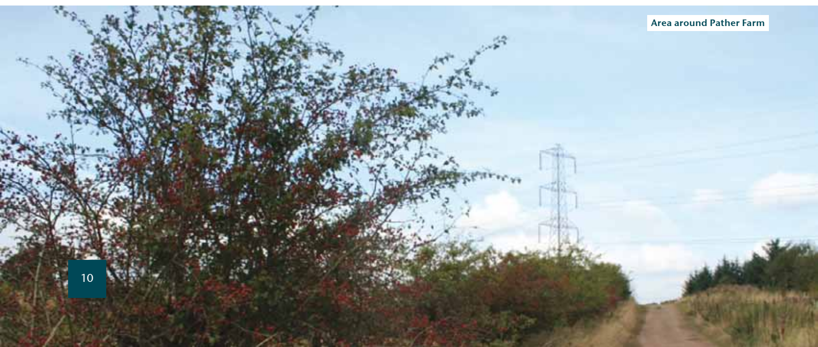
Area around Pather Farm

a) Stand-off distances will be required from the pylon lines crossing the area to allow access for operational and maintenance purposes. Developers will take advice from Scottish Power Energy Networks regarding appropriate operational distances from electricity transmission equipment.