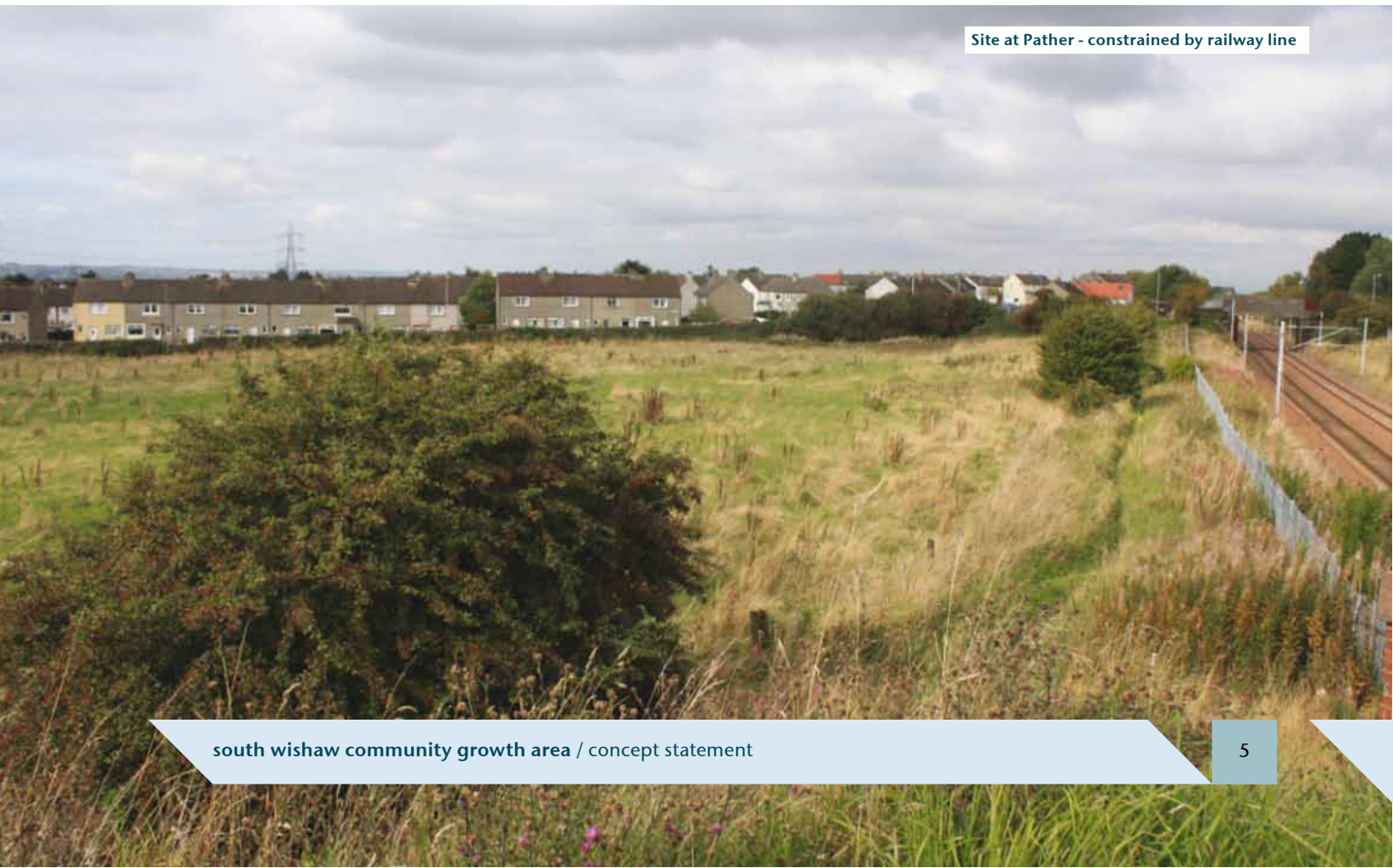
Site at Pather - constrained by railway line

The sites identified as part of the South Wishaw CGA take the form of several parcels of land to the north of Overtown and south of Waterloo, amounting to 38 hectares west of the A71 and 27 hectares east of the A71; known constraints in terms of ground conditions and the location of infrastructure, will require to be investigated further before final capacities can be determined. It is intended that the CGA will be developed during the period from 2011 to 2020 and beyond. Development phases will initially focus on the areas in the west adjacent to existing urban areas.