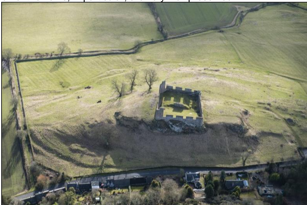
Figure 1: Aerial Image, Hume Castle and settlement