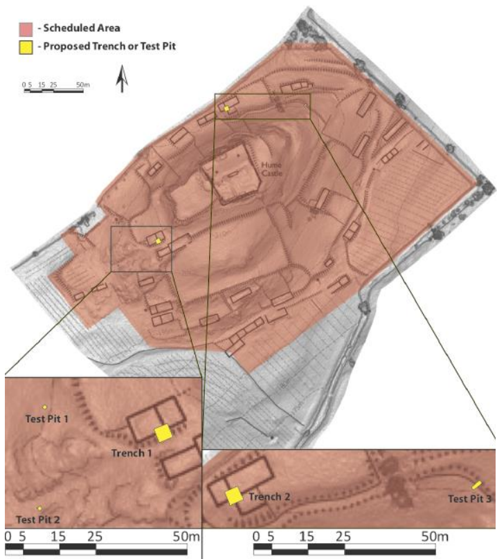
Figure 2: Scheduled Area and Proposed Trench and Test Pit Locations