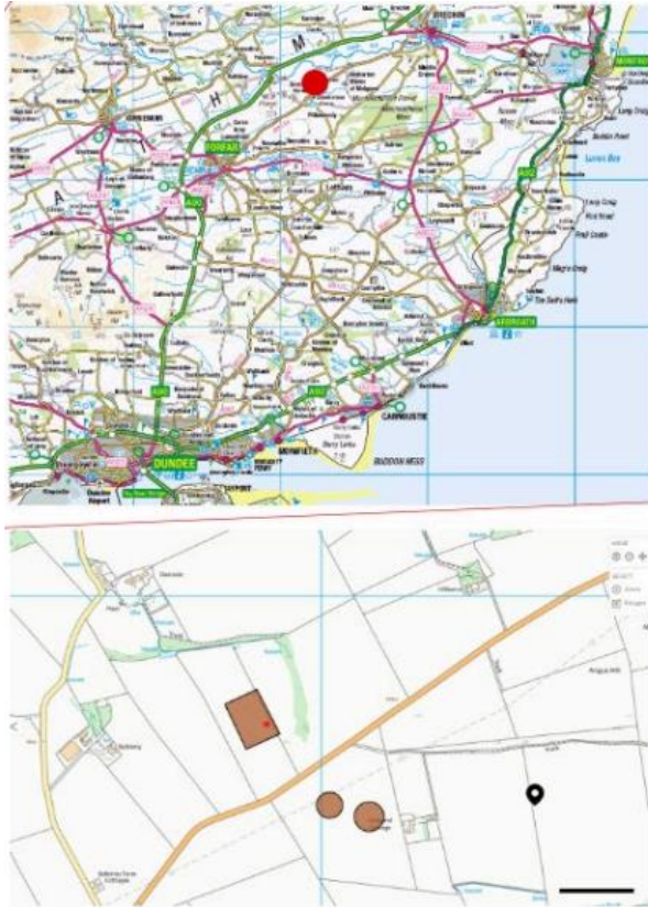
Figure 1 – Location map