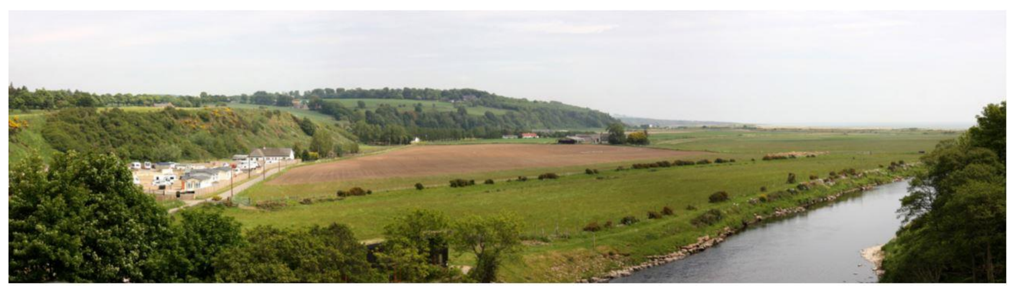
Figure 4 - View of Site incorporating River North Esk