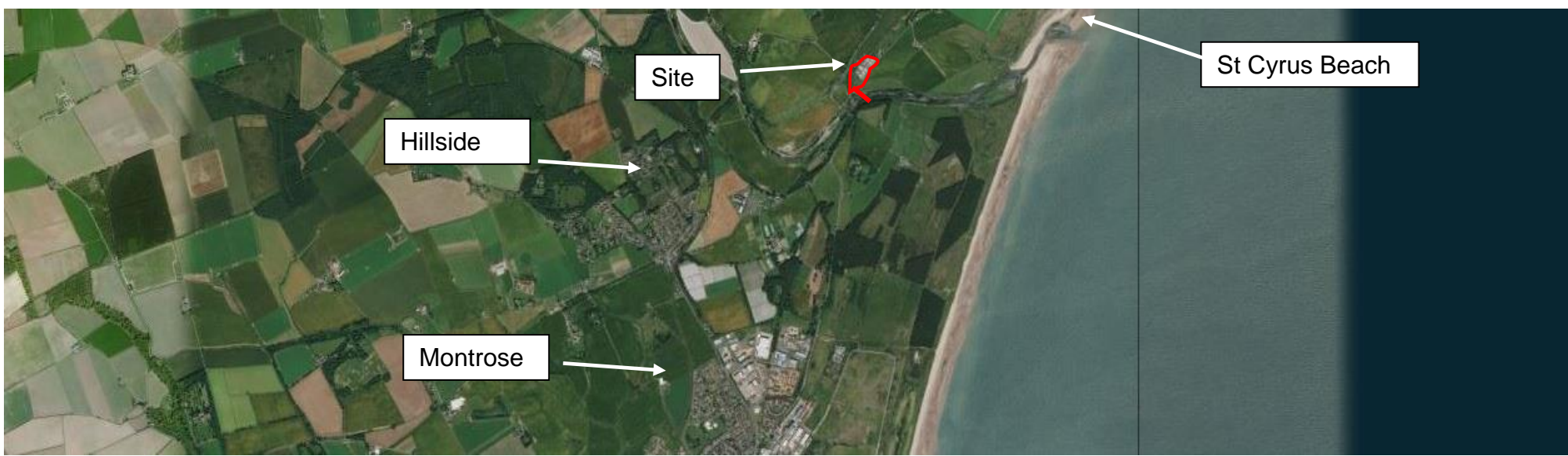
Figure 1 - Wider Site Context (zoom earth)