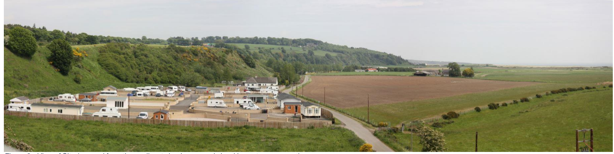
Figure 3 - View of Site