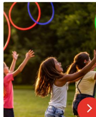
Coronavirus guidelines for children