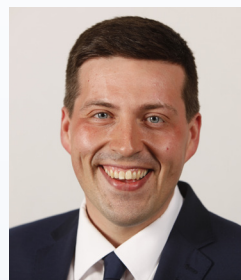
Jamie Hepburn MSP Minister for Business, Fair Work and Skills

I remain committed to ensuring no one is left behind in Scotland’s labour market. Our recovery will be an opportunity to do things differently, rebuilding our economy with wellbeing and fair work at its heart. I am confident this tried and tested service will make an essential contribution to our economic recovery and continue to provide support for those who need it most.