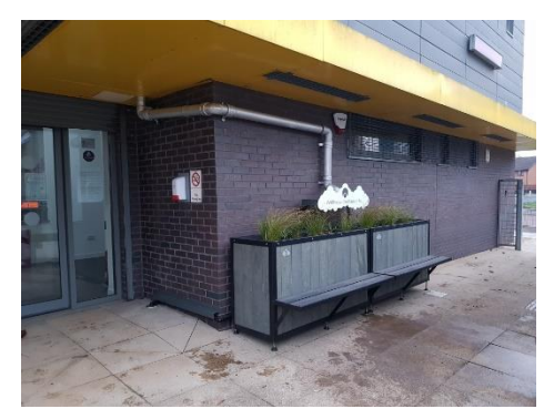
Figure 7: Wellhouse Community Centre, Glasgow – SUDS Planter