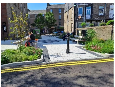
Figure 8: Craigie Street, Dundee - Pocket Park (SUSTRAN Scotland, Dundee City Council and Scottish Water Project)