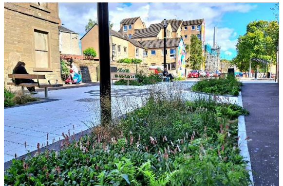
Figure 9: Craigie Street, Dundee – Pocket Park (SUSTRAN Scotland, Dundee City Council and Scottish Water Project)

Blue-green infrastructure helps to ensure that our wastewater and drainage networks can work properly and brings other benefits to our towns and cities. They enhance our neighbourhoods by providing attractive places that support nature where we can spend our leisure time. They also offer other benefits such as providing shade in hot weather and improving air and water quality.