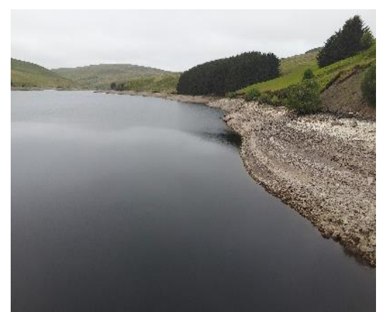
Figure 3: Whiteadder Reservoir

This summer, the equivalent of 10 days of rain fell in an hour at Hampden Park on 20 June 2023. Just weeks before this happened, we saw those living in Broadford being impacted by a dry period resulting in emergency supply measures being taken to ensure they had enough drinking water.