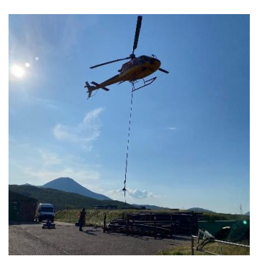
Figure 6: Emergency measures to maintain water supply in Broadford 2023