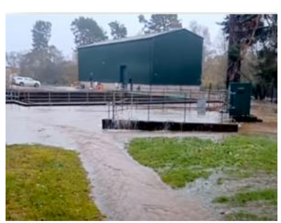
Figure 4: Ballater Water Treatment Works 2022

The health of Scotland's economy, society and environment is increasingly reliant on how effectively we respond to the impacts of climate change. As the climate continues to shift, life in Scotland may look different to how it looks today. The demand for water will continue to grow as the weather gets warmer and this will affect many aspects of our lives including our crop management and food supply. There will also be pressure on our drinking water supply, affecting not only the amount of water available but also the quality of the water that we take from the environment to use for drinking water.