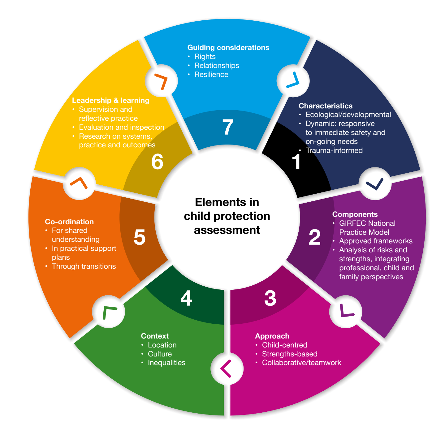
Figure 3: Elements in child protection assessment.