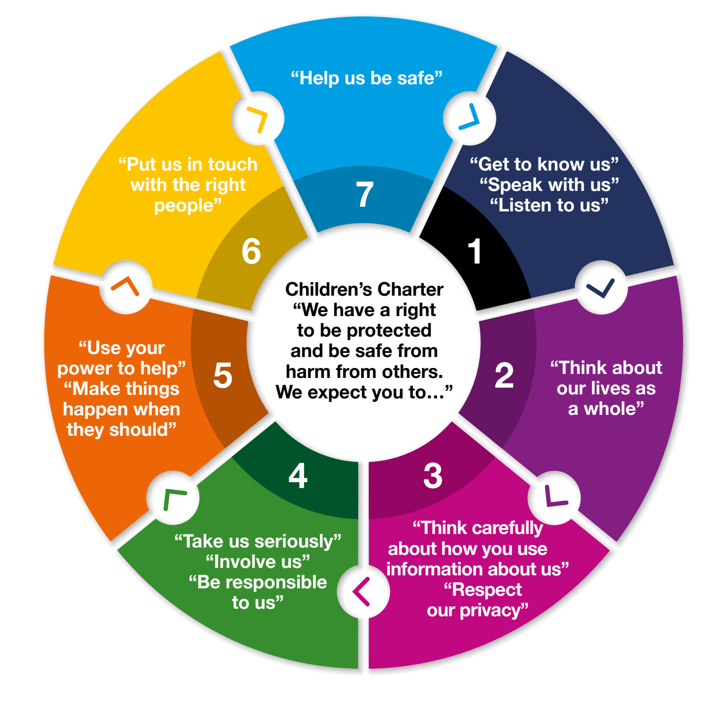
Figure 1: Expectations from children who may be involved in child protection processes.