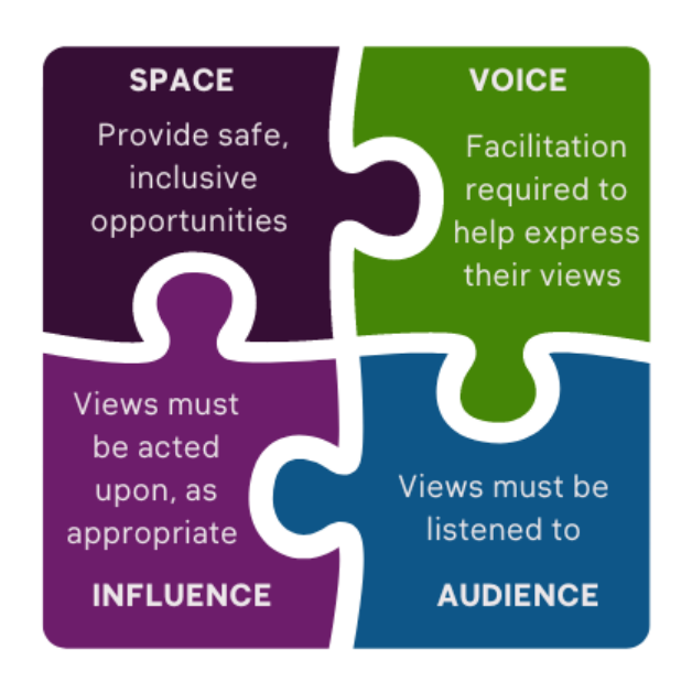
Figure 1: The Scottish Model of Infant Participation based on Article 12 of the United Nations Convention on the Rights of the Child. Adapted from Lundy (2007) and DCYA (2015).

SPACE and VOICE relate to the infant's right to express their views.