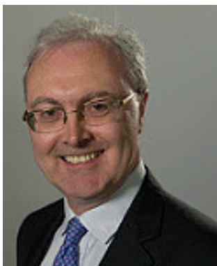
James Wolfe QC The Lord Advocate

While the cut and thrust of Parliamentary debate enriches our democracy, it is one of the essential functions of a Parliament to pass laws.