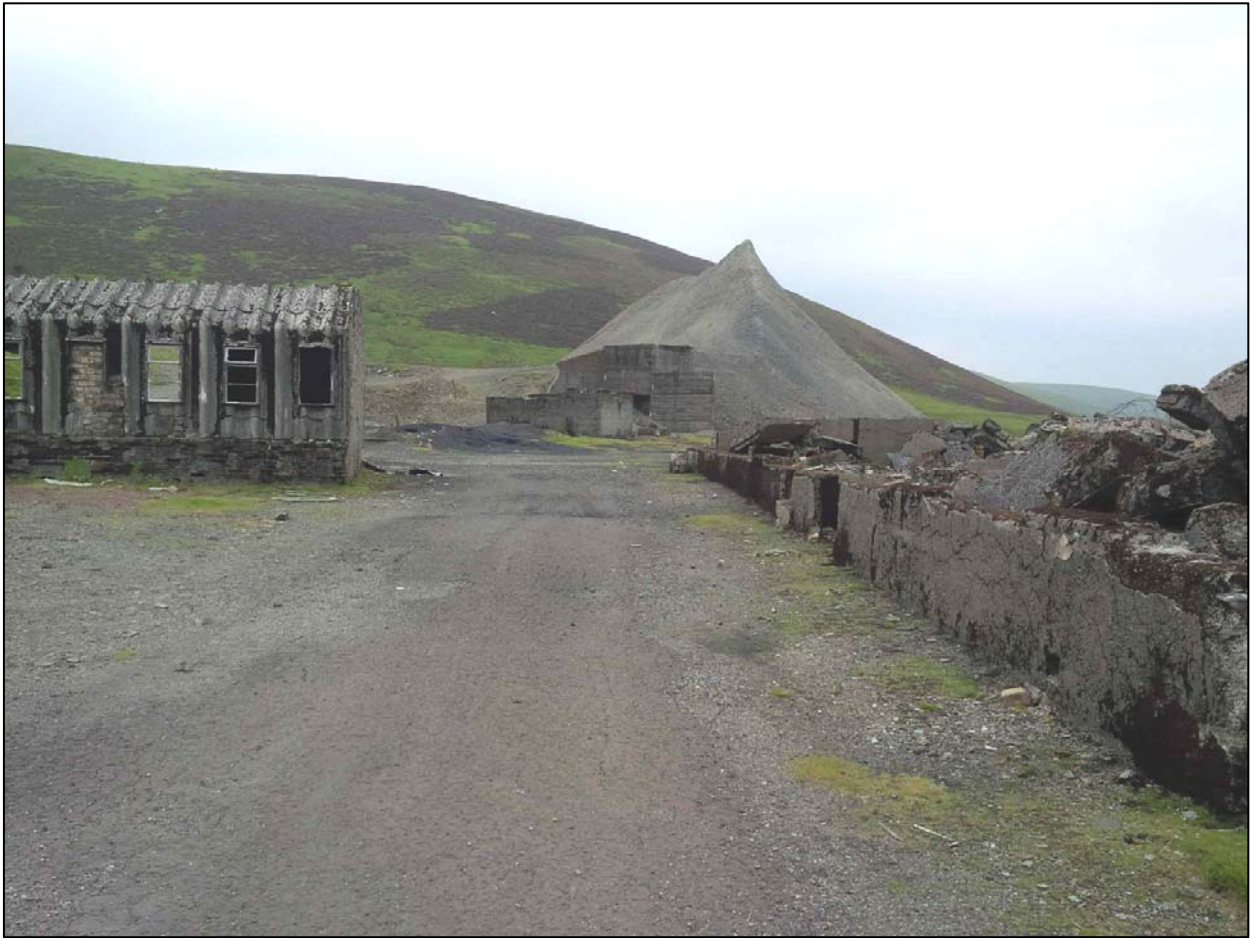
Figure 1: Spoil Heap at Wanlockhead