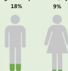
NPS use in the last month among 15 year olds who had used drugs in the past month, by gender

As well as being more likely to have taken drugs overall, boys were also more likely than girls to have taken an NPS: 18% of 15 year old boys who had taken drugs in the past month had taken an NPS, compared with 9% of girls.