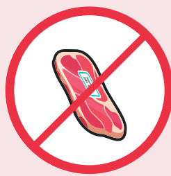
Hams and bacon