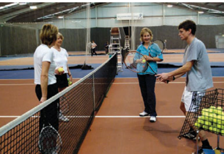
A Physical Activity programme is at the heart of legacy

Alongside this, we will commit a range of funding to support our legacy ambitions. This will include the CashBack for Communities scheme which has already committed £7.5m to various sports projects in local communities that will help to increase participation, feed into the governing bodies development plans and, crucially, provide a first opportunity for many young people to get involved in structured sport. Also, launched in November 2008, the Big Lottery Fund's 2014 Communities programme offers small grants to help build a legacy of wellbeing in communities across Scotland, particularly through taking part or volunteering in sport or physical activity. They have allocated £1.3m up to 2010 and plan to allocate a further £5.5m leading up to Glasgow 2014.